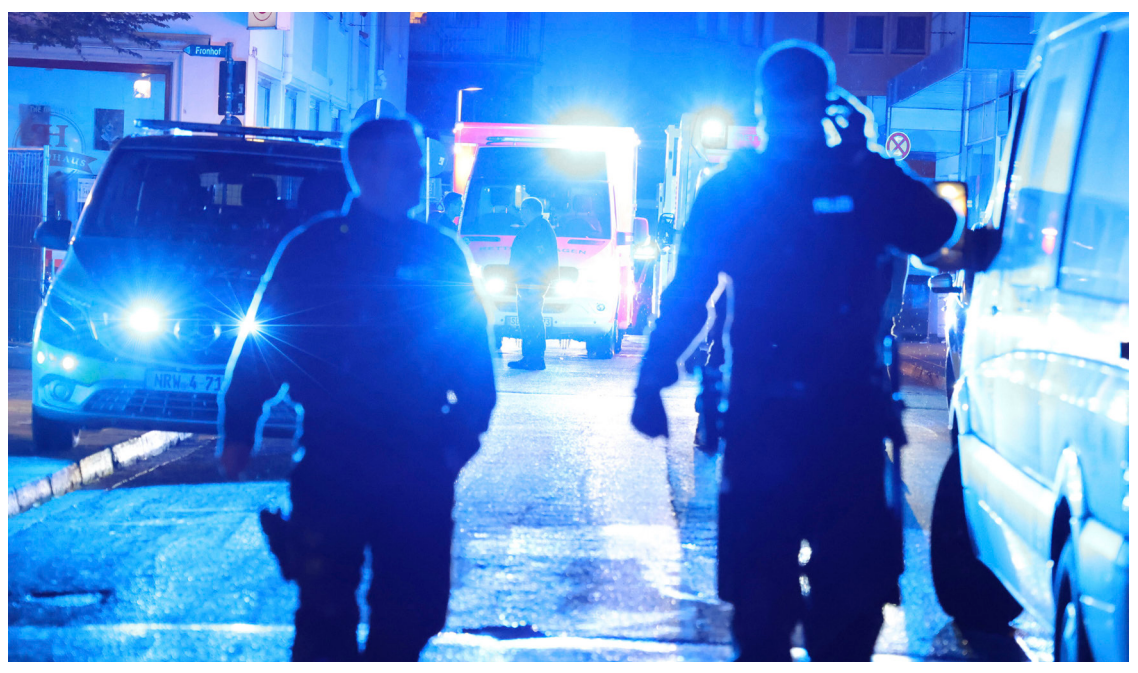
Police stand near the scene of the attack during celebrations in Solingen, Germany, on August 23, 2024.

GDP office in Libya was mothballed and AFO took on oversight of North Africa as well. This was driven partly by ISWAP operational prowess, where Nigerian forces have been unable to suppress it in large swathes of northeastern Nigeria and it has been able to pose a cross-border threat into Chad and eastern Niger. ISGS, in turn, once it managed to deconflict with the local al-Qa`ida affiliate, became increasingly effective in the tri-border area of Mali, Burkina Faso, and western Niger. It will be interesting to see whether AFO tutelage sees a revival of the largely quiescent Islamic State cells in North Africa, but for now, as in the other half of Africa, the threat is not projected outside the region.