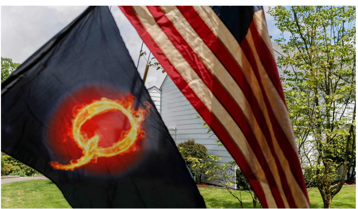
A QAnon flag is held by a protester at the Governor's Mansion, in Salem, Oregon, on April 25, 2020, during a rally against economic-closure efforts aimed at minimizing the impact of COVID-19.