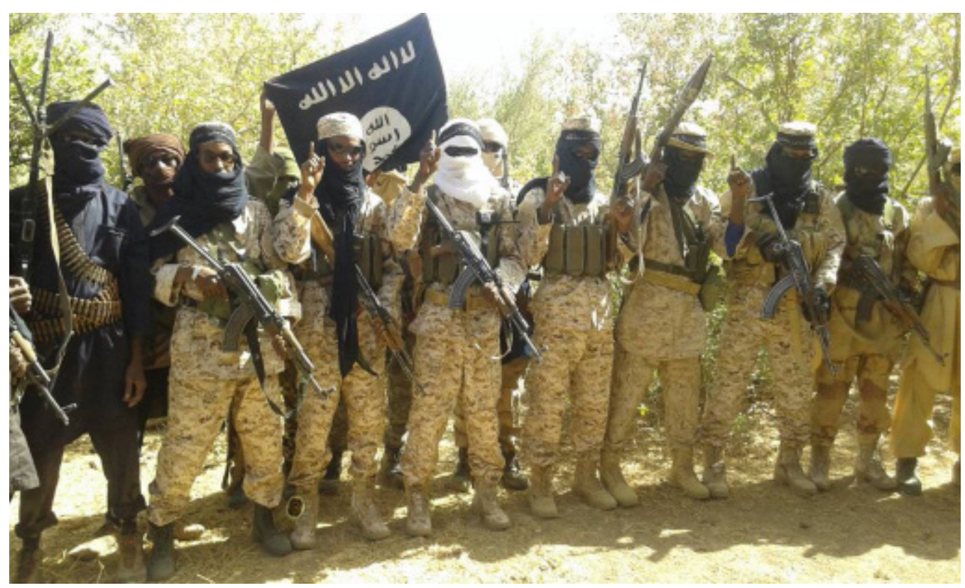
ISGS fighters in Burkina Faso, seemingly during a pledge ceremony to the Islamic State, in an undated picture obtained by the authors in April 2018

tensions in the Sahel in a video released by its Yemen Province in April 2020, which accused al-Qa`ida of "deviating" following the Arab Spring protests. <sup>108</sup> In regard to the Sahel, the video strongly denounced AQIM's actions in the 2012 jihadi takeover of northern Mali and condemned AQIM and its then leader, Abdelmalek Droukdel, for working with "apostate movements," namely the National Movement for the Liberation of Azawad, in the occupation. <sup>10</sup>