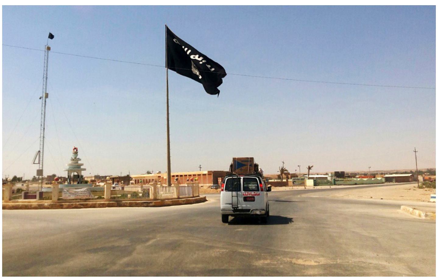
This file photo shows a motorist passing by a flag of the Islamic State group in central Rawah, Iraq, on July 22, 2014.

in house by its own leaders who were largely competent analysts of their environment. ^{\rm 27\;d}