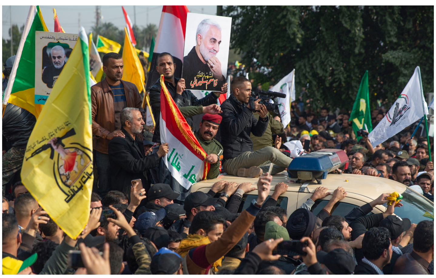
Mourners march during the funeral of Iran's top general Qassem Soleimani and Abu Mahdi al-Muhandis, deputy commander of Iran-backed militias in Iraq known as the Popular Mobilization Forces, in Baghdad, Iraq, on January 4, 2020.

43, plus 15 MPs in parliament), <sup>33</sup> represented by Qais al-Khazali, who had been previously toeing a cautious line in the summer <sup>34</sup> as his advocates in the Iraqi government lobbied to keep him from being targeted with U.S. sanctions. <sup>35</sup> e Toward late summer, al-Khazali became more outspoken against the United States and his militias seemed to begin to rocket U.S. bases in their areas of control (i.e., Taji <sup>36</sup> and Balad <sup>37</sup> f). In October 2019, al-Khazali chose to align his movement with the anti-protest crackdown, <sup>38</sup> one of a number of rhetorical and operational indicators that AAH had decided in the summer to sail closer to IRGC-QF and al-Muhandis, even at the risk of receiving a sanctions designation by the United States.