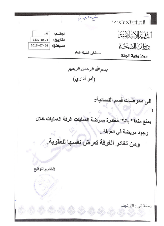
Figure 2 - Item S: Islamic State, Administrative Order from al-Tabqa Hospital to Female Section Nurses, July 26, 2016

prioritization of nurses' duty of chaperoning female patients. It is not possible here to comment on the standard of care provided. However, it is clear that these policies sought to demonstrate the Islamic State's unwavering commitment to morality, public decency, and piety—perhaps at the expense of service efficiency.