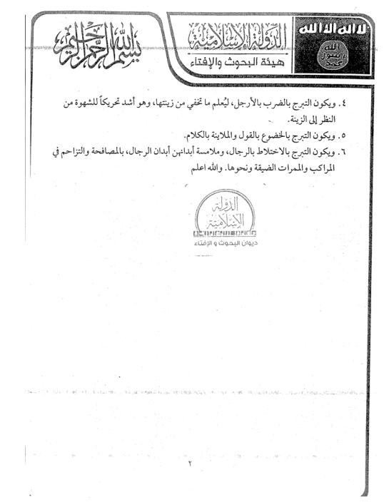
Figure 1 - Item H: Islamic State, "Fatwa 44," December 18, 2014