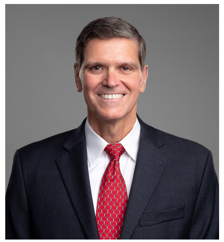
General (Ret) Joseph L. Votel

more incremental approach to this and build confidence and build capacity and kind of set the scene for the campaign that followed. And we had to do better integration of our campaign plan with the humanitarianside and the government side. And I think we became proficient with that.