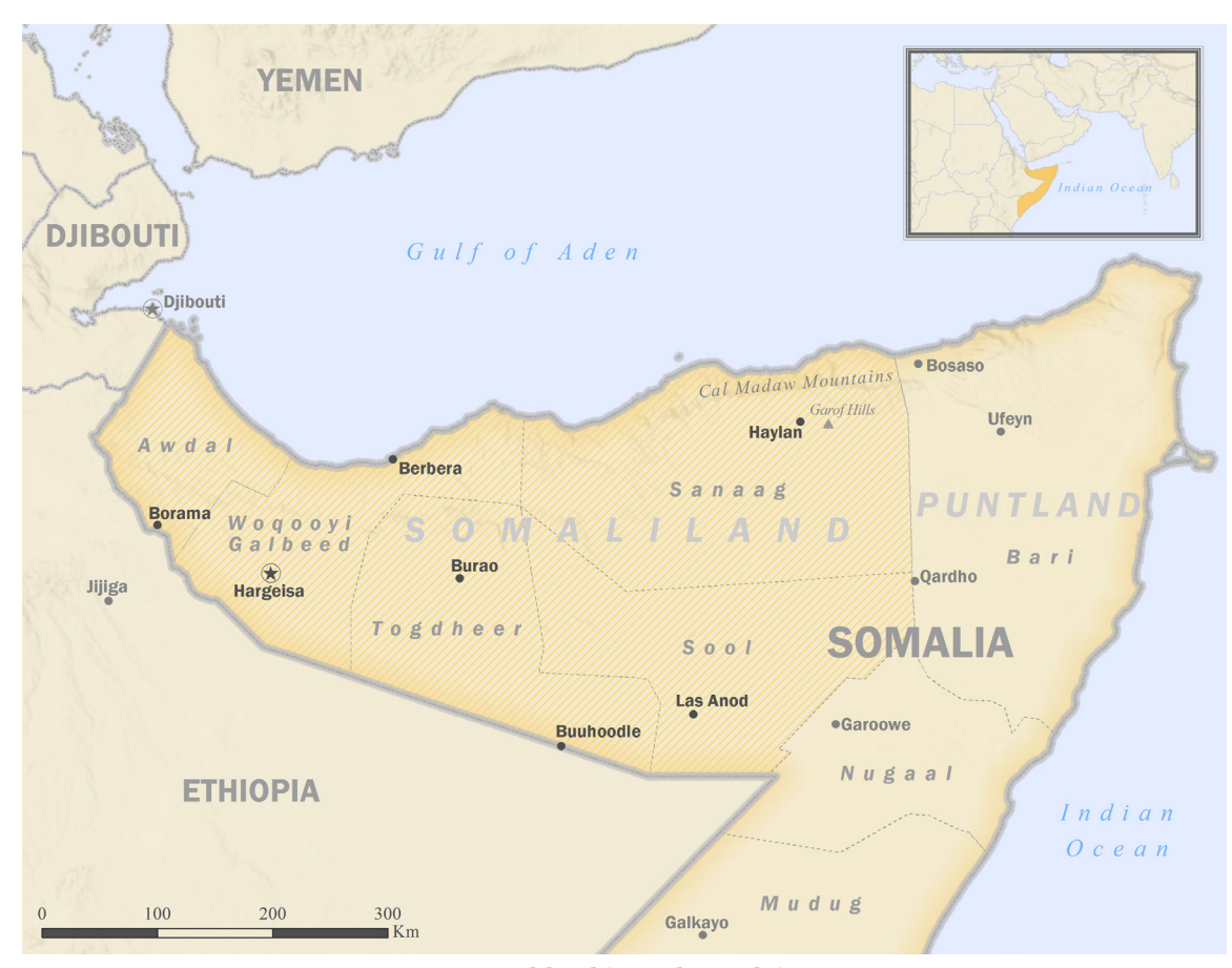
Somaliland (Brandon Mohr)