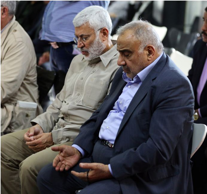
Abu Mahdi al-Muhandis, left, a commander in the Popular Mobilization Forces, and Adel Abd Al-Mahdi, right, then Minister of Oil and now Prime Minister of Iraq, attend the funeral of Iraqi politician Ahmad Chalabi, in Baghdad, Iraq, on November 3, 2015.

PMF Basra Operations Command, both led by Badr commanders. 98 These commands appear to be maintained by Badr in readiness for any of a number of contingencies: the deployment of Badr PMF units to restore order during electricity-related or secessionist rioting, to deliver civil engineering and disaster relief, or to crack down on uncontrolled militias. t