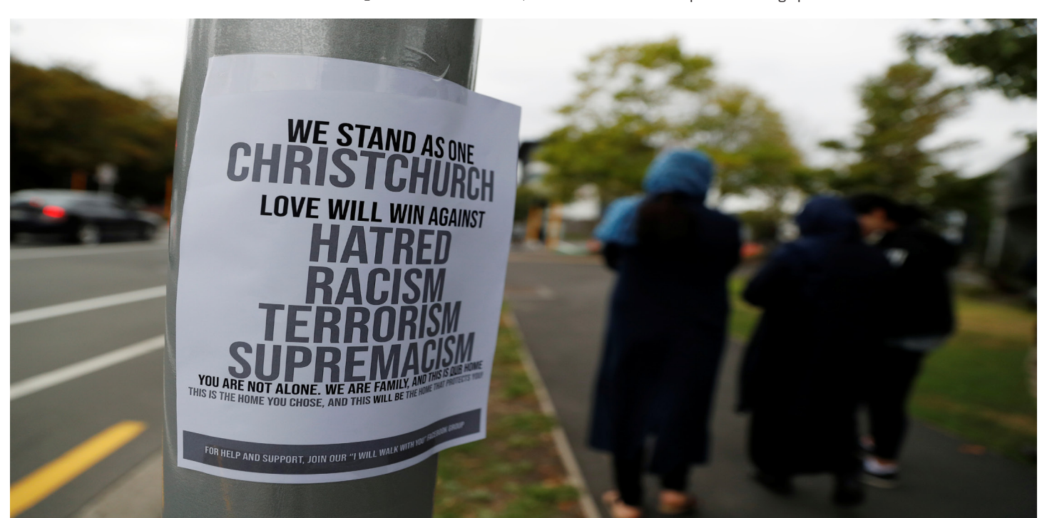
A sign is seen on March 16, 2019, after the mosque attacks outside a community center near Masjid Al Noor in Christchurch, New Zealand.

c The GIFCT 'hash' database creates 'digital fingerprints' of terrorist content and shares it with participating companies so that they can identify and remove such content—videos and images—from their own platforms or in some cases block it prior to it being uploaded.