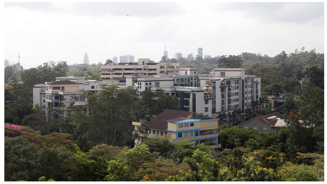
The Dusit D2 hotel complex is seen on January 16, 2019, after security forces had killed all four militants who stormed the upscale hotel in Nairobi, Kenya.

Al-Qa`ida first made its debut in East Africa in 1992, when Usama bin Ladin and his entourage settled in Sudan. With the support of his Sudanese hosts, notably the ideologue Hassan al-Turabi, bin Ladin set to work amassing resources, building a network of alliances, and training a new generation of jihadis. At the time, AQEA was indistinguishable from al-Qa`ida Core. Operations in the region were led and orchestrated by Egyptian members of bin Ladin's inner circle, including his deputy, Abu Ubaidah Al-Banshiri; al-Qa-