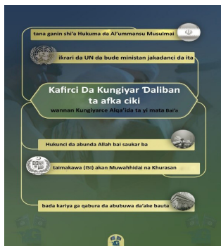
Critique of al-Qa`ida/Taliban