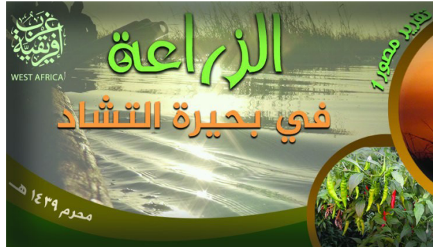
Harvest of ISWAP in Lake Chad and obituary of one of ISWAP's media representatives published by the Islamic State

and savvy in the way they appeal to their followers to befriend the local communities within and outside the areas of their control. 170