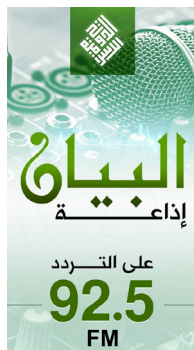
Radio al-Bayan IS