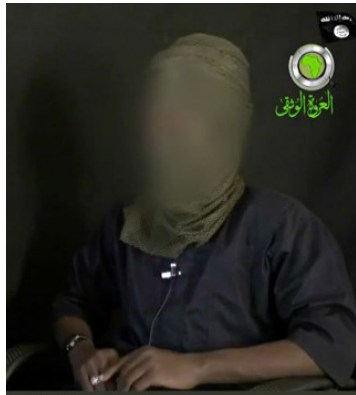
Abu Mus`ab al-Barnawi