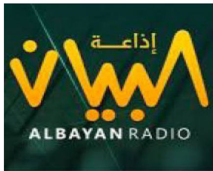
Radio al-Bayan ISWAP