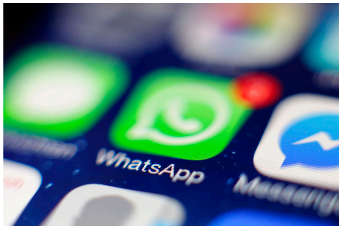
WhatsApp iPhone mobile app icon