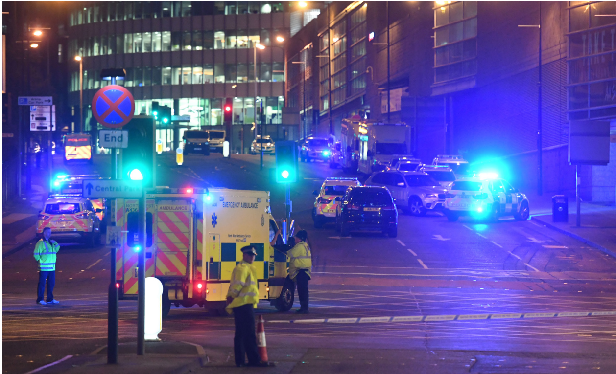
Emergency response vehicles parked outside the scene of the terror attack in Manchester, England, on May 23, 2017.

between his return from Libya and the attack, sources told CNN. 29