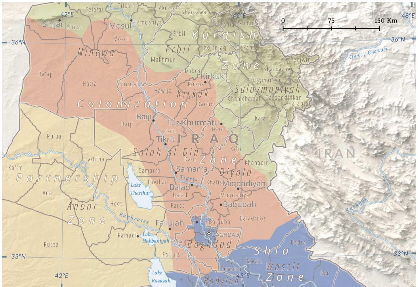
Colonization Zone in Iraq (Rowan Technology)