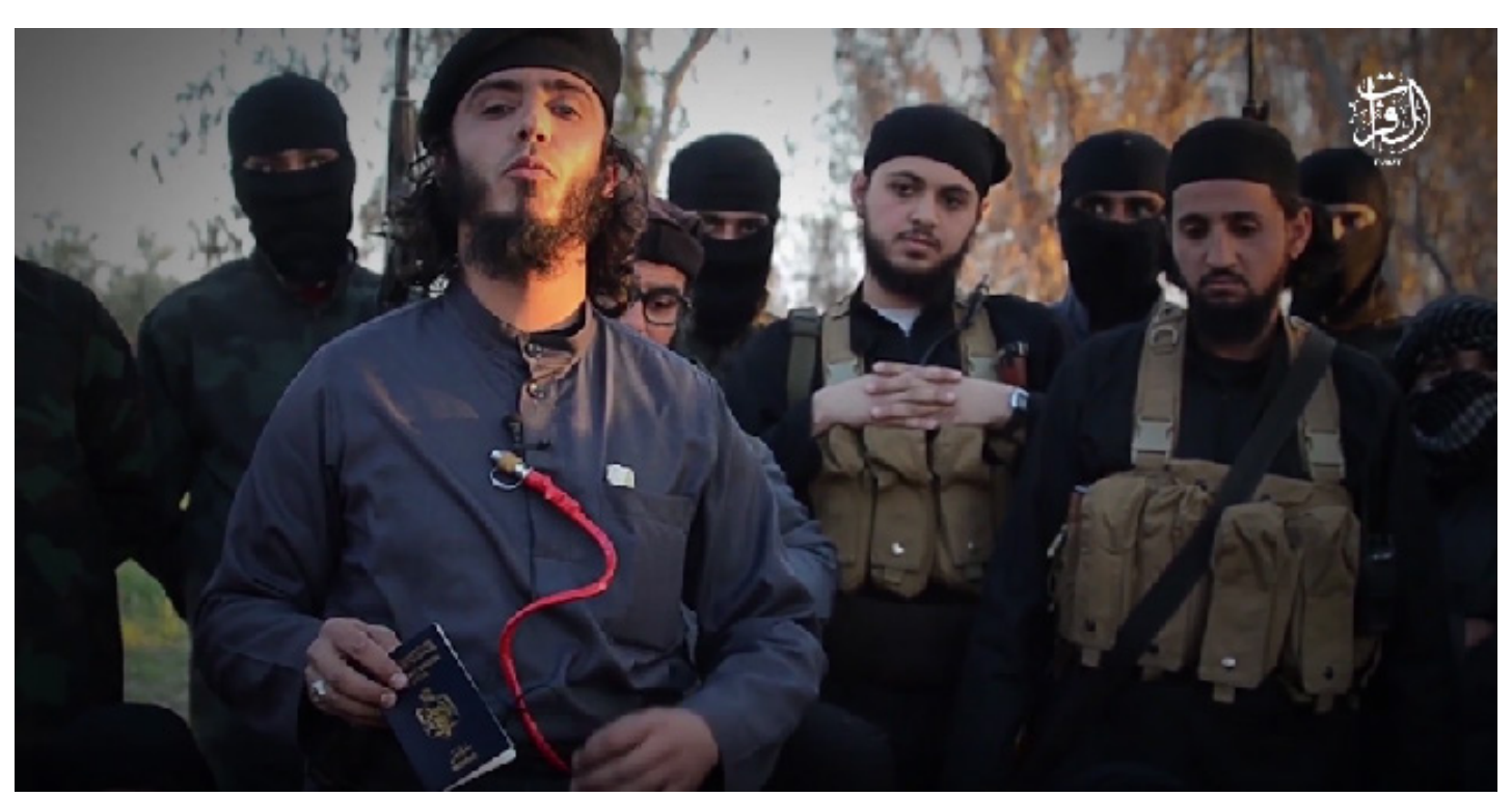
A Jordanian Islamic State fighter holds up his passport in an April 2014 Islamic State video in which fighters burned their passports.