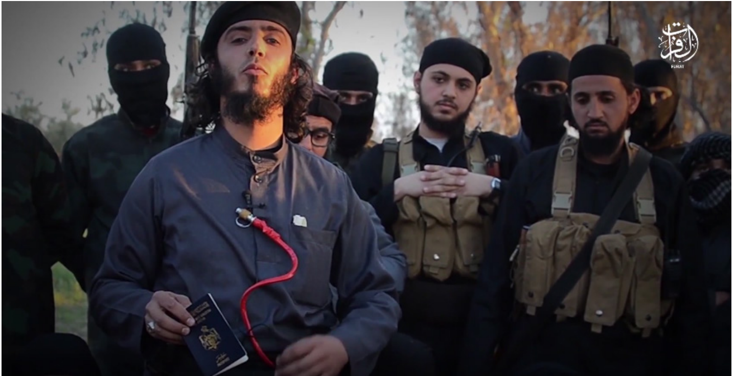
A Jordanian Islamic State fighter holds up his passport in an April 2014 Islamic State video in which fighters burned their passports.

Beyond these attacks lurk several deeper security threats. First, the discovery of an enormous arms and explosives cache maintained by the Karak terrorist cell revealed the ease with which militants can obtain weaponry today. 13 Jordan has been saturated with arms since it began supporting Western-backed Syrian rebels by serving as a key training and supply route. While weapons smuggling has surged, so too have thefts of combat supplies. In the largest known case to date, huge CIA shipments of U.S.- and Saudi-supplied arms were reportedly stolen and resold on the black market, including some that investigators believe were used in the November 2015 attack that killed Americans. 14 Second, while recent terrorism involved just a few dozen attackers, there is a far larger pool of extremists and thus potential terrorists. Each successive attack suffered over the past year was followed by security crackdowns rounding up hundreds more suspected militants. By one estimate, for example, the police and GID arrested 700 suspected jihadis in the two months following the December 2016 Karak siege. 15