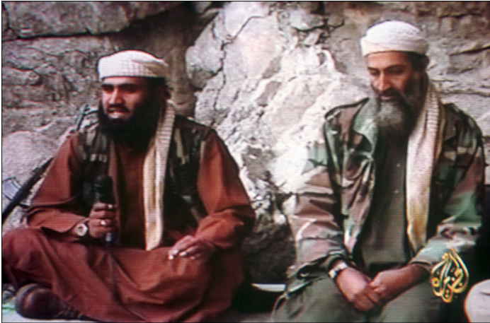
A screen capture of Sulayman Abu Ghayth, al-Qaeda spokesman, and Osama bin Ladin released by Al-Jazeera in 2001.

lies. 18 A few months later, Iranian officials indicated their willingness to provide “shelter” to some two dozen al-Qaeda members, while expelling the other jihadis. According to Abu Ghayth, the reason for the expulsion was a growing resentment on the part of the Iranian population who were “not happy” with the growing number of Arab families “spread[ing] among the Iranian population.” 19 Whatever the reason, al-Qaeda members in Iran saw the expulsion as a betrayal. 20 This was relayed in a comprehensive report provided to bin Ladin in an October 2010 letter by a onetime al-Qaeda member who had been detained in Iran and was allowed to leave the country around 2010. The letter was authored by Abu Abd al-Rahman Anas al-Subay’i, most likely an alias for famed operative Abu Anas al-Libi (Nazih Abdul-Hamed Nabih al-Ruqaii)—a onetime Libyan member of al-Qaeda and a longtime member of the Libyan Islamic Fighting Group (LIFG). Al-Libi was indicted for the 1998 U.S. Embassy bombings in Kenya and Tanzania and died in a New York hospital in January 2015. e