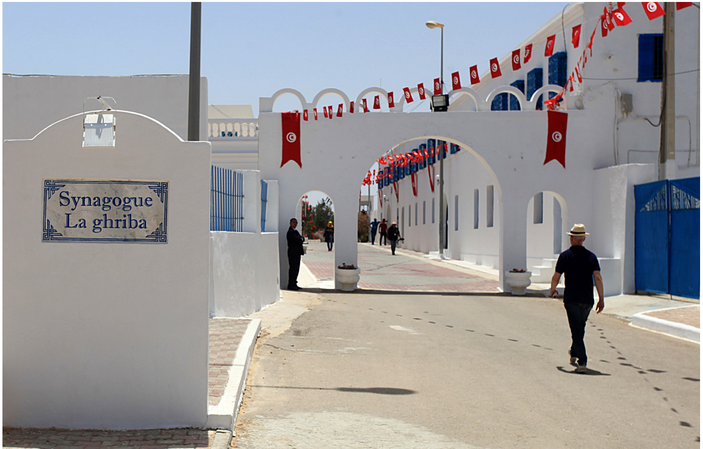
El-Ghriba synagogue in Djerba, Tunisia, in May 2016