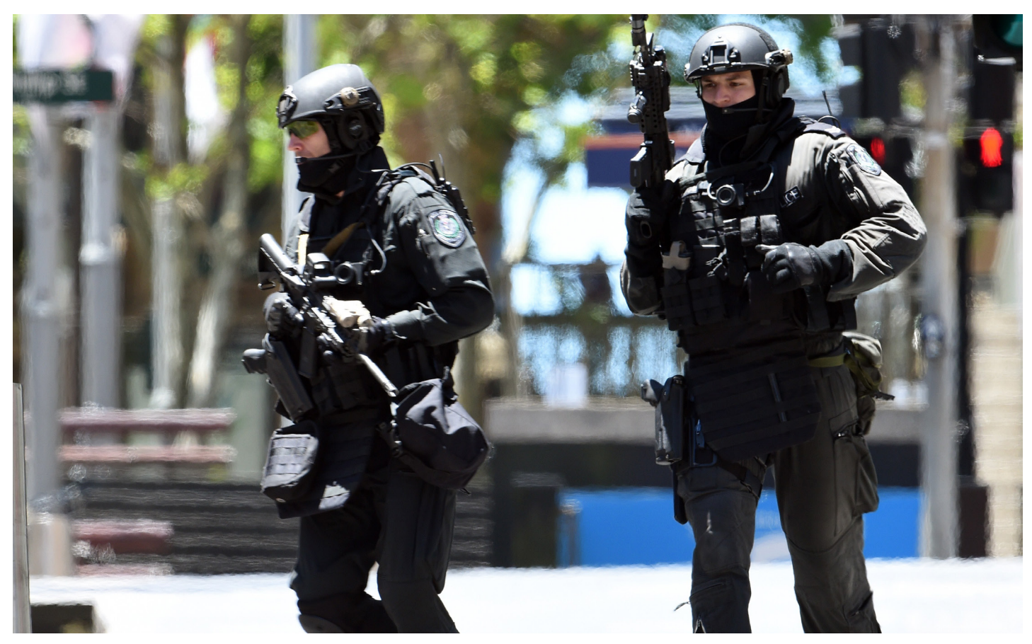
Armed police during the hostage siege at a cafe in Sydney, Australia, on December 15, 2014

war against Islam.<sup>e</sup> Some Australians who had not been involved in jihadism before 9/11 now became involved, manifesting in a series of self-starting terror plots.