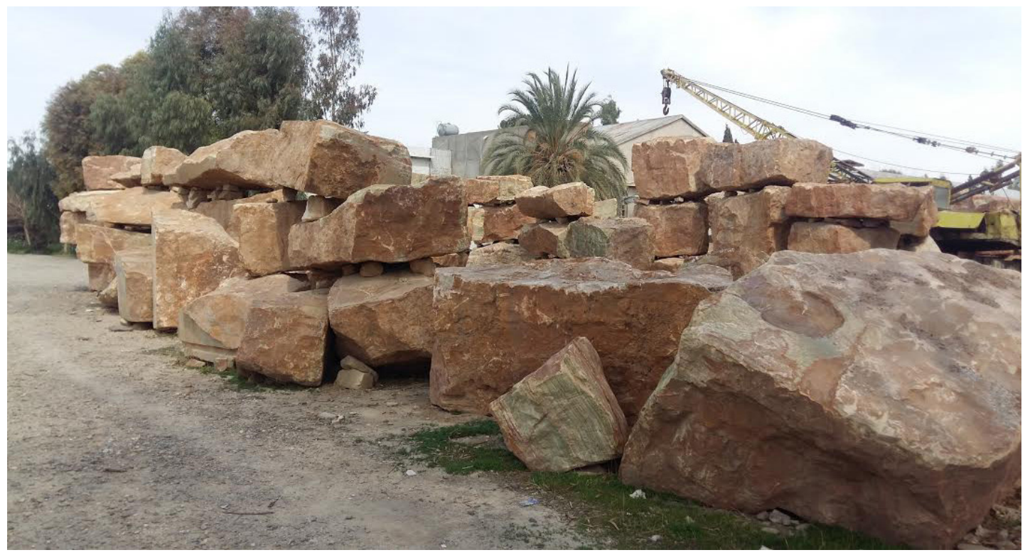
Slabs of rokhaam (marble) await further processing at a warehouse in Lashkar Gah City, Helmand Province, on March 6, 2017. These stones are representative of the only two percent of Helmand's overall marble output that can be taxed by the Afghan government and sold to local Afghan markets. The rest is exploited by the Taliban and smuggled to Pakistan.

While the Afghan government's envoy to Helmand reported in June 2016 that the Taliban earn between $18.25 million and $21.9 million per year from mining and transporting marble,<sup>27</sup> sources in Helmand reported in January 2017 that the Taliban most likely earn much more than the government is reporting. The Taliban's taxation of marble differs depending on the color and quality of the stone. The four most common types of marble, known locally as rokhaam , are yellow, light green, dark green, and pink. Veins of yellow marble are now uncommon; light green is considered the lowest quality; dark green is the second best; and pink is considered the best quality stone.