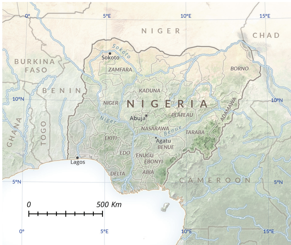
Nigeria

One claim that has gained traction among leaders of the Igbo (a large ethnic group with an estimated population of 30 million people in southern Nigeria) is that the country's president, Muhammadu Buhari (a Fulani), is pursuing the Islamization of Nigeria by allowing Fulani herdsmen to murder Christians. 11 These claims were rejected on October 10, 2016, by the Sultan of Sokoto, Muhammadu Sa'ad Abubakar III, a Fulani and one of Nigeria's leading Islamic authorities: "The problem with herdsmen and farmers is purely about economy. The herdsman wants food for his cattle; the farmer wants his farm produce to feed his family." 12 There have been calls for the sultan to make a personal intervention, appealing to the Fulani's respect for "true leaders and their traditional institutions." 13 The sultan, however, like the cattle associations representing the herders, claims that those involved in the violence are "foreign terrorists ... the Nigerian herdsmen are very peace-loving and law-abiding." 14