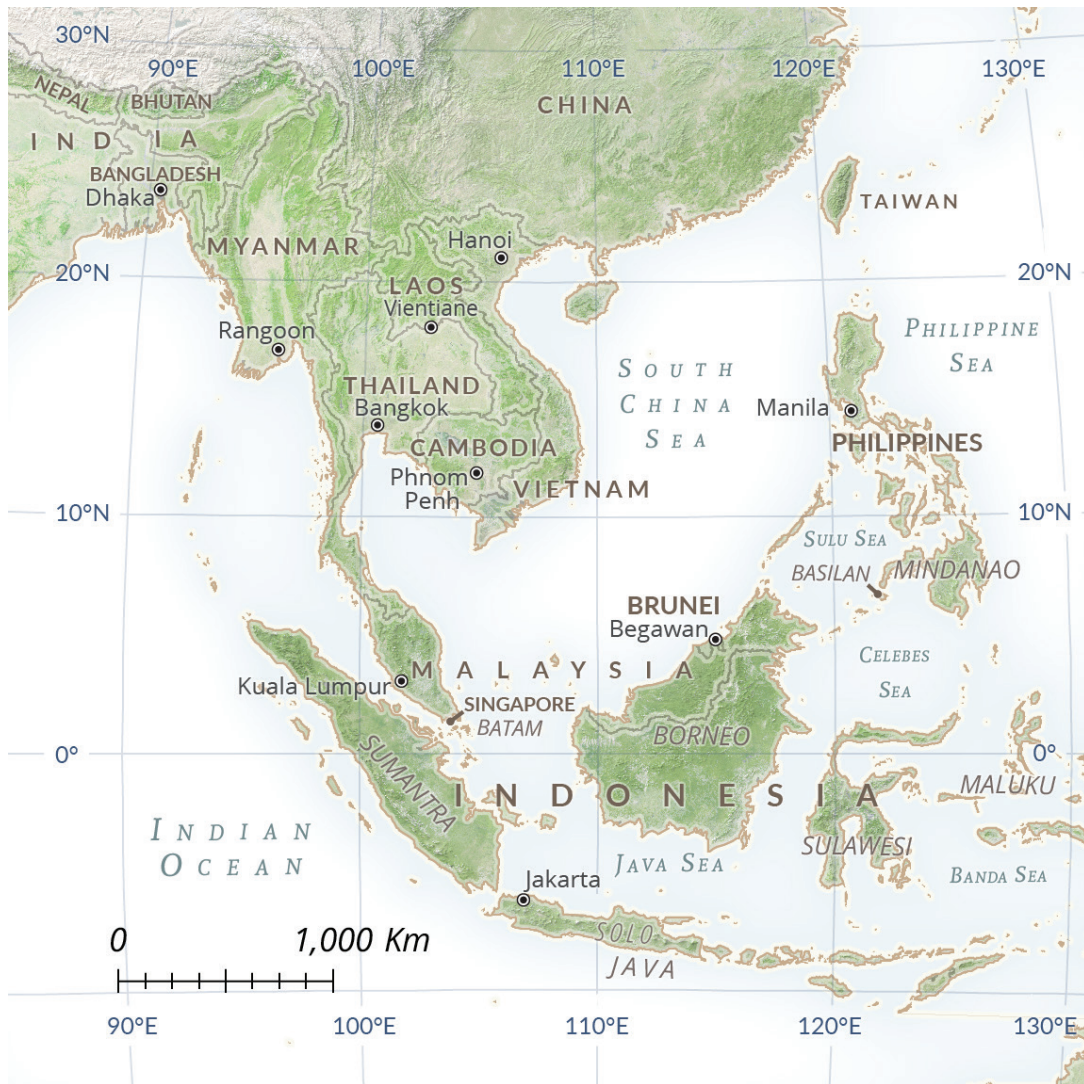
Southeast Asia (Rowan Technology)

sian ideologue who has been incarcerated since 2011. 18h Indonesian militants thought to be in Syria may also have enabled the January 2016 Jakarta attacks, but there are conflicting reports over whether Bahrun Naim or another Indonesian Islamic State figure known as Bahrumisyah influenced the plot from Syria. 19 Naim's controlling hand was, however, clear in the most recent attack in Indonesia, the failed suicide bombing of a police station in the Central Java city of