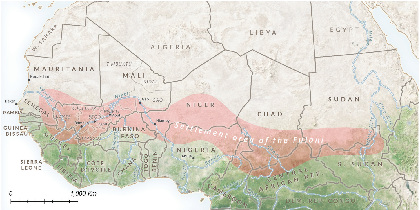
Sahel Region

lani, in turn, accuse their host communities of cattle rustling (theft) and therefore regard punitive violence against these communities as just and appropriate. The Fulani herders complain that they are otherwise faced with the choice of returning to lands that cannot sustain them or abandoning their lifestyle by selling their cattle and moving to the cities. 4