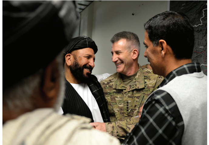
GEN Nicholson at a security shura with the head of Kandahar Provincial Council

Nicholson: I don't see those two groupings coming together. Haibatullah a has made statements telling the Taliban to attack the Islamic State. Al-Baghdadi's rhetoric is pretty clear. So we don't see some sort of accommodation between the Taliban and Islamic