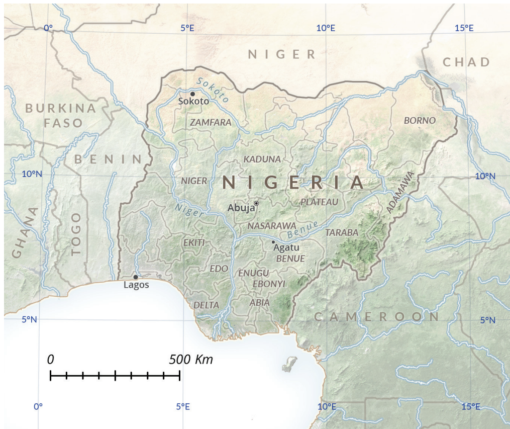
Nigeria

One claim that has gained traction among leaders of the Igbo (a large ethnic group with an estimated population of 30 million people in southern Nigeria) is that the country's president, Muhammadu Buhari (a Fulani), is pursuing the Islamization of Nigeria by allowing Fulani herdsmen to murder Christians. 11 These claims were rejected on October 10, 2016, by the Sultan of Sokoto, Muhammadu Sa'ad Abubakar III, a Fulani and one of Nigeria's leading Islamic authorities: "The problem with herdsmen and farmers is purely about economy. The herdsman wants food for his cattle; the farmer wants his farm produce to feed his family." 12 There have been calls for the sultan to make a personal intervention, appealing to the Fulani's respect for "true leaders and their traditional institutions." 13 The sultan, however, like the cattle associations representing the herders, claims that those involved in the violence are "foreign terrorists ... the Nigerian herdsmen are very peace-loving and law-abiding." 14