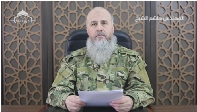
Hashim al-Sheikh (Abu Jaber) makes his first appearance as General Commander of Hay'at Tahrir al-Sham in a video released on February 9, 2017.

Jaysh al-Ahrar, d but the foremost reason for its emergence was to pressure Ahrar al-Sham to merge with Jabhat Fateh al-Sham in some way. Conversely, other elements of Ahrar al-Sham were pushing back against the merger, knowing that formally uniting with Jabhat Fateh al-Sham would lead to isolation from the group's foreign backers, e especially Turkey. Since launching operations in north Aleppo countryside under the 'Euphrates Shield' moniker in late August 2016 (countering both the Islamic State and the Kurdish-led Syrian Democratic Forces) and since the retaking of Aleppo city by the regime, Turkey's insistence on Assad's departure has become less and less vocal. Turkey has also been working with Russia to secure its interests in northern Syria, with the latter even providing some air support for Euphrates Shield. 2 Ahrar al-Sham has been participating in Euphrates Shield as well, f clearly to the chagrin of those who came under Jaysh al-Ahrar and wanted closer relations with Jabhat Fateh al-Sham.