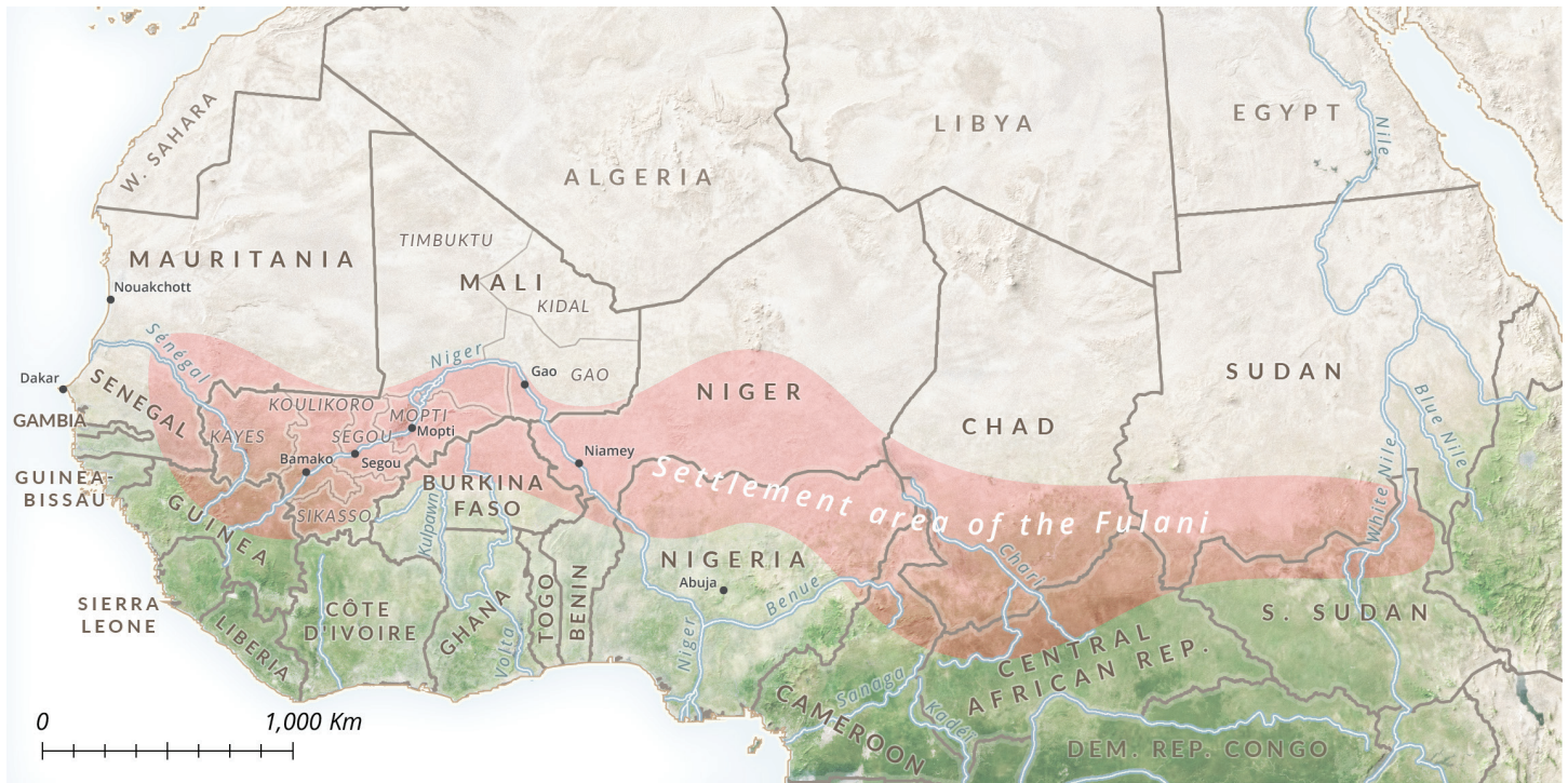
Sahel Region

lani, in turn, accuse their host communities of cattle rustling (theft) and therefore regard punitive violence against these communities as just and appropriate. The Fulani herders complain that they are otherwise faced with the choice of returning to lands that cannot sustain them or abandoning their lifestyle by selling their cattle and moving to the cities. 4