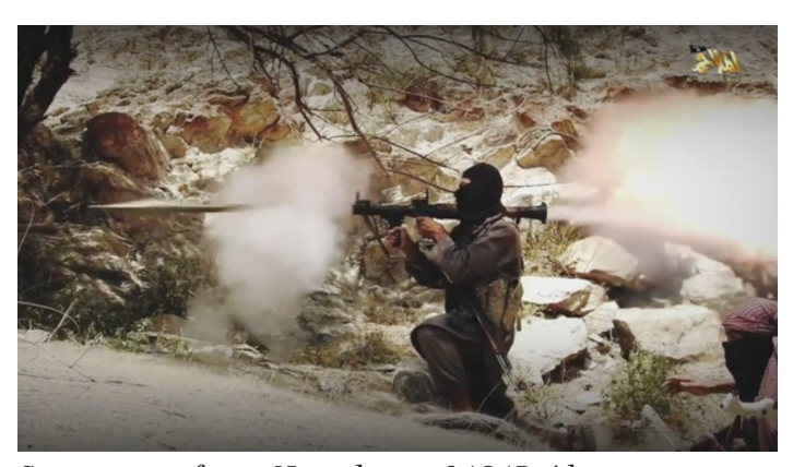
Screen capture from a November 2016 AQAP video