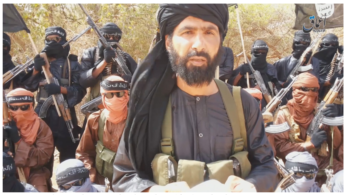
Screen capture from October 2016 video of Murabitoun's bay `a to the Islamic State

attacks<sup>d</sup> near the borders of Burkina Faso, Niger, and Mali. The first attack occurred on the nights of September 1-2, 2016, when ISGS targeted a gendarmerie in Burkina Faso near the Nigerien border and killed two guards. The second occurred about a month later on October 12. The group attacked a police outpost in Intoum, Burkina Faso, just kilometers from the Mali border, which killed three police. The third, and certainly most sophisticated, was ISGS' orchestration of an attempted jailbreak of the high-security Koutoukale Prison in Niamey, Niger, on October 17, 2016. Though guards ultimately fully repelled the attack—killing one assailant wearing a suicide vest—the attempted prison break was important in that the prison held suspected Boko Haram affiliates and other suspected Islamist militants from the Sahara and Sahel. Apart from these larger-scale attacks, ISGS has undertaken other criminal activities.<sup>c</sup>