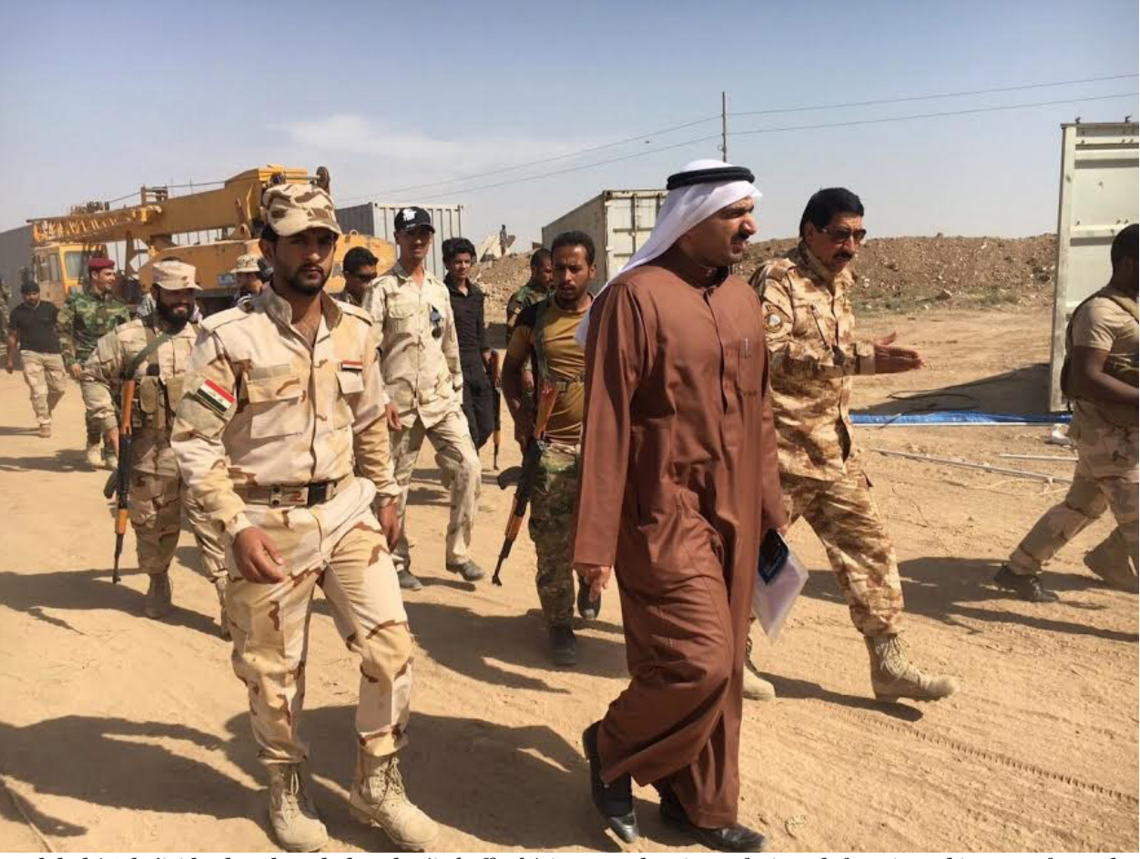
Hashd al-`Asha'iri leader Ahmad al-Jarba (in keffiyeh) inspects the Lions of Nineveh force in Rabia west of Mosul on October 10, 2016.

The contribution of these groups will be relatively limited compared to the extensive fighters and firepower that are rallying around Mosul. However, small, organized local groups were instrumental during the offensive to liberate Qayyara, for example targeting Islamic State fighters on the streets, and also played an important role in Fallujah.<sup>63</sup> Several of the Iraqi sources interviewed for this article told the author that before, during, and after the operation to take back Mosul, these networks are expected to assist in identifying and targeting critical Islamic State locations and elements.<sup>64</sup> This could play a critical role in displacing the group from the city by making offensive operations more effective and weakening the Islamic State morale and its ability to hold ground. Just days before the Iraqi offensive of Mosul started, the Islamic State appears to have brutally suppressed an attempt by some of its fighters to switch sides.<sup>65</sup>