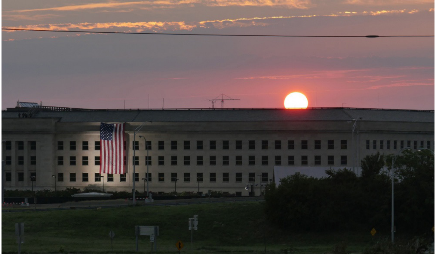
The Pentagon prior to a ceremony to commemorate the 15th anniversary of the 9/11 attacks

and stage attacks overseas. When the United States talks about defeating the Islamic State, debates about intervention are fuzzy. Are we targeting elements that threaten American cities? Or helping foreign partners defeat elements that threaten foreign cities? The first is and should be an American-led effort. The second is and should be, after the lessons from major American interventions in Afghanistan and Iraq, a foreign-led effort, supported by the United States' military, diplomats, and intelligence officers.