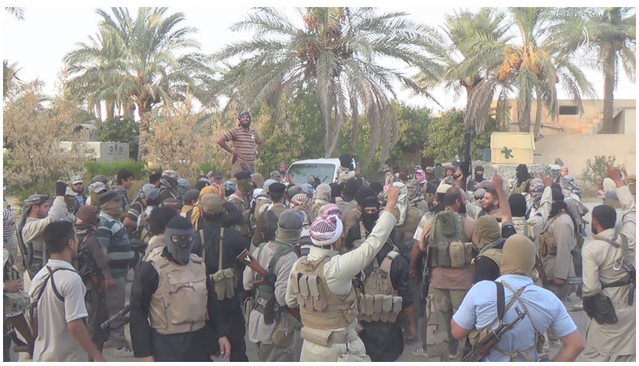
Screen capture from video released in August 2016 by Diyala Media Bureau, Islamic State

fed into the northern fight against the Kurds for control of Jalula, which the Islamic State seized in a massive deliberate assault on August 11, 2014, that employed 20 suicide vest bombers. This northern preference seems to have been based on the Islamic State's alliance with local tribes in the Lake Hamrin area, arguably the only place in Diyala where AQI/ISI and later the Islamic State maintained a strong, pre-existing base of support in 2014. When Kurdish forces moved forward to replace a collapsing Iraqi security forces (ISF) presence in late June and July, the Islamic State quickly struck deals with anti-Kurdish Sunni tribes such as the Kerwi and strongly supported a joint operation against the Kurds.<sup>i</sup>