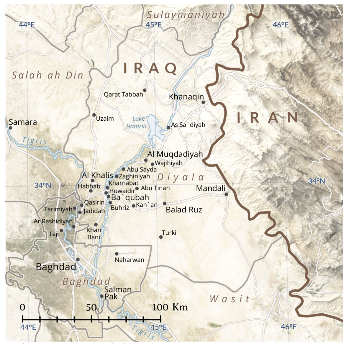
Diyala province, Iraq

reasons, the Islamic State and its predecessors have repeatedly built bases for fighters and their families north of the river in the remote groves of Diyala, a completely different concept from their nesting within pre-existing, semi-urban Sunni areas in Iraq.<sup>5</sup> Rural Diyala is currently a true terrorist safe haven.