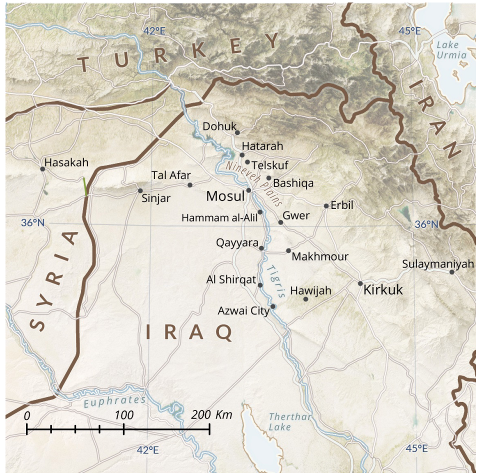
Northern Iraq

Gulf States, and their divergent political and military agendas will complicate the retaking and rebuilding of the city.