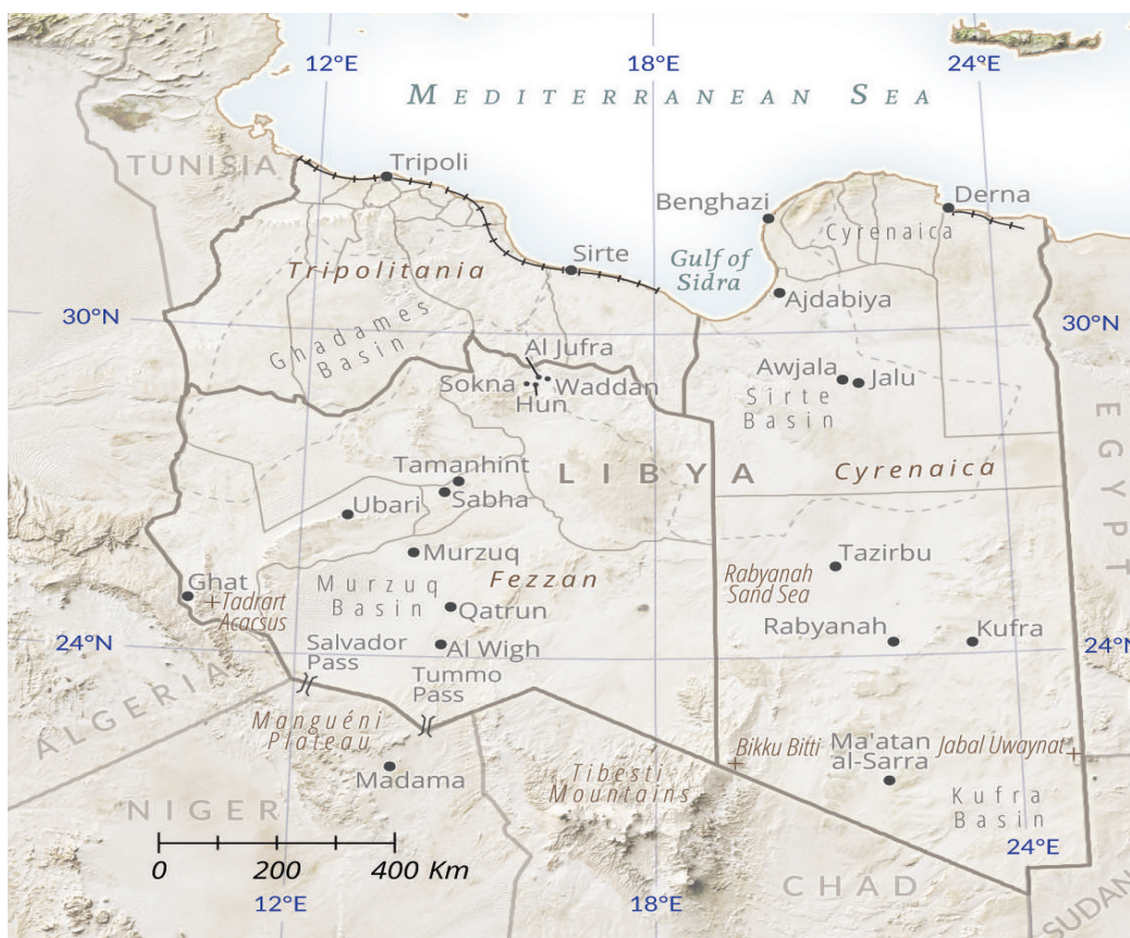
Strategic locations in Libya (Rowan Technology)

These oases are not in southern Libya proper, but they form an important link on the Kufra-Ajdabiya road and an entry point to the