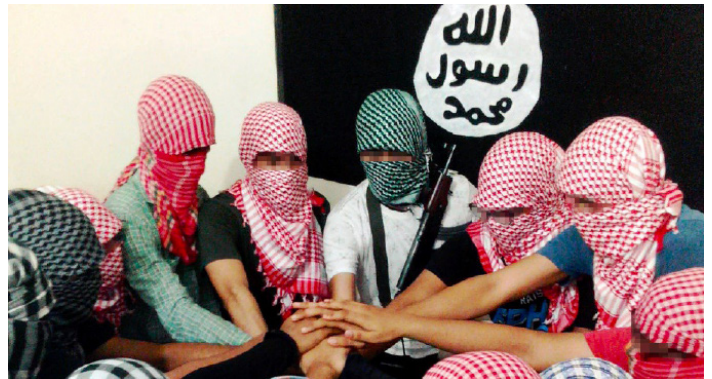
Purported members of Bangladeshi group Soldiers of the Khilafah