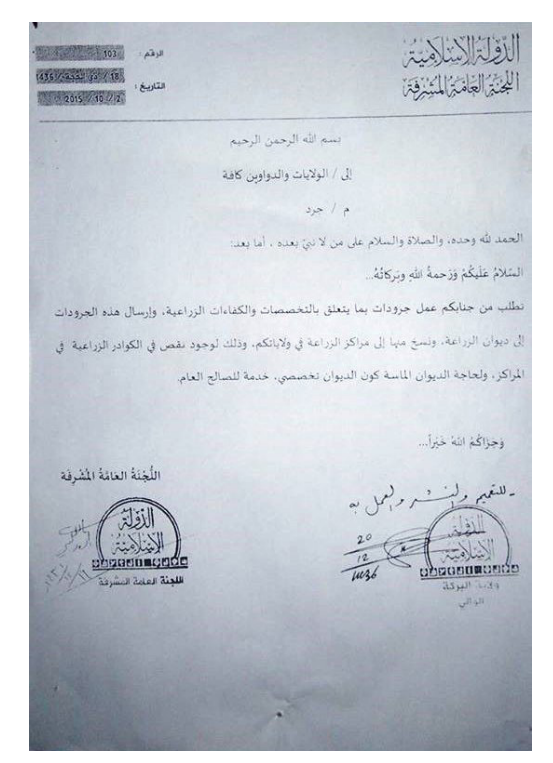
Item F: Directive no. 103 from the General Governing Committee. Date on document: 18 Dhu al-Hijja 1436 AH (October 2, 2015 CE). Obtained from documents left behind in al-Shaddadi in Hasakah province after the Islamic State lost control of the area to the Syrian Democratic Forces (SDF). The document was provided to the author by a Syrian Kurdish journalist who visited al-Shaddadi in February-March 2016.