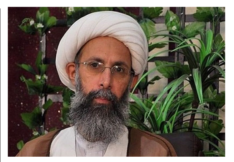
Sheikh Nimr Baqir Al-Nimr

The role played by Saudi Arabia's Specialized Criminal Court (SCC) in the handling of al-Nimr's case warrants closer consideration. Established in 2008, the SCC is charged with prosecuting criminal cases involving terrorism.18 Al-Nimr was executed among 47 others on a battery of terrorism-related charges that represented the kingdom's largest mass execution since 1980.1 Three other Shi`a activists were executed along with al-Nimr. The remaining 43 individuals included dozens of Saudis linked to numerous al-Qa`ida terrorist attacks and other terrorism-related activities in the kingdom between 2003 and 2006.<sup>m</sup> The inclusion of al-Nimr among known al-Qa`ida members, including militants who have targeted U.S. and foreign interests and personnel in Saudi Arabia, in essence, likens the late cleric to some of the kingdom's most dangerous and violent opponents. More importantly, it signals Saudi Arabia's determination to root out all forms of domestic political dissent. Reformist currents that challenge the authority of the monarchy and call for a more participatory and democratic form of governance appear to be seen by some key figures in the Saudi power structure as an existential threat.