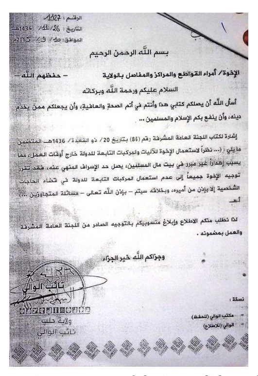
Item B: Preventing unnecessary use of Islamic State vehicles outside of operation hours. Date on document: 26 Dhu al-Qi'da 1436 AH (September 10, 2015 CE). It was obtained in November 2015 from the north Aleppo village of Delha after the Islamic State lost control of it to Syrian rebels. The document was provided to the author by a media activist working with the rebel forces fighting the Islamic State in north Aleppo.