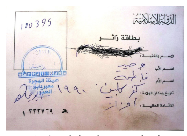
Item G: Visitor's pass for driver from Azaz area through crossing at Dabiq (name redacted to protect driver's identity). Date on document: 29 Jumada al-Awal 1437 AH (March 9, 2016 CE). Obtained by the author in March 2016 from a contact in Azaz who knows the driver.