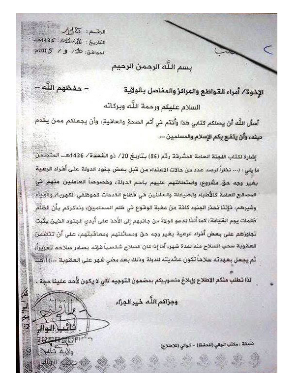
Item E: Observation by General Governing Committee on misconduct by fighters. Date on document: 26 Dhu al-Qi'da 1436 AH (September 10, 2015 CE). Obtained in November 2015 from the north Aleppo village of Delha after the Islamic State lost control of it to Syrian rebels. The document was provided to the author by a media activist working with the rebel forces fighting Islamic State in north Aleppo.