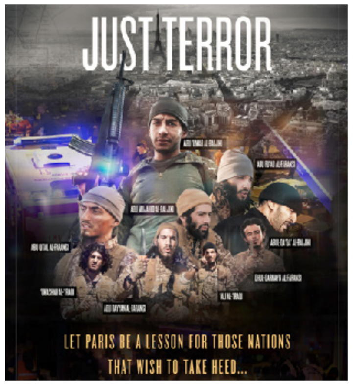
Islamic State propaganda following the Paris attacks

Narratives about what the Islamic State is fighting for—the creation of a legitimate state with control over a defined territory or the precipitation of a Western ground invasion as part of an imminent apocalypse—have been difficult to harmonize, especially given