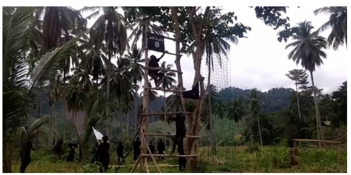
An image from a purported Islamic State-produced video featuring a "boot camp" in the jungles of Mindanao, released December 2015.

None of the above provides definitive evidence that the Islamic State has managed to establish a concerted operational presence in the Philippines. To date, most of the group's activities appear to have been directed toward two ends: proselytism and recruitment.