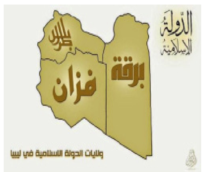
The Islamic State's three self-proclaimed provinces in Libya: Wilaya Barqa, Wilaya Tarabulus, and Wilaya Fezzan

Second, Libyans have strong municipal and tribal affiliations. These affiliations most clearly manifested themselves in the uprising against the Qadhafi government in 2011 when militias representing different regions like the Nafusa Mountains, or cities, like Misrata, or even neighborhoods, like Souq al-Jumaa in Tripoli arose. Libya's tribes are also important, with tribal affiliations bleeding into politics and violent conflict alike. For example, the Awlad Suleiman have had violent turf wars with the Tebu in south-