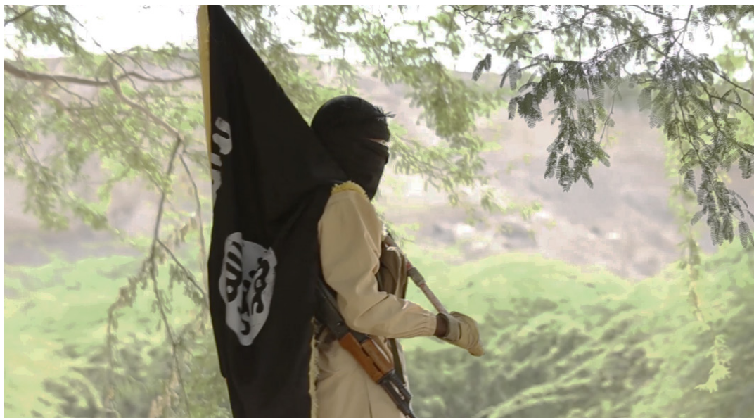
This image from an Islamic State video shows one of its fighters in Yemen.

The chaos across the Middle East and Africa, however, will be of secondary concern next to the violent acts by lone wolf terrorists in North America, Europe, and Australia, and the implications those hold for relations between non-Muslim majorities and Muslim minorities. Whether the Islamic State is seen to be ascendant or under threat, some individuals