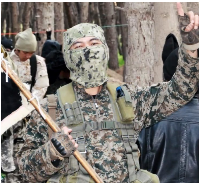
This image from a video released by al-Furat shows an Indonesian Islamic State recruit in Syria.