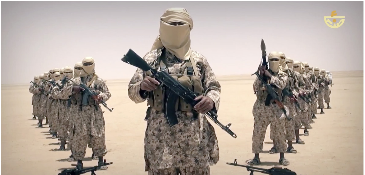
In this image from an Islamic State video fighters train in Yemen.

Throughout 2015, AQAP and the Islamic State in Yemen focused primarily on domestic enemies, particularly the Houthis. However,