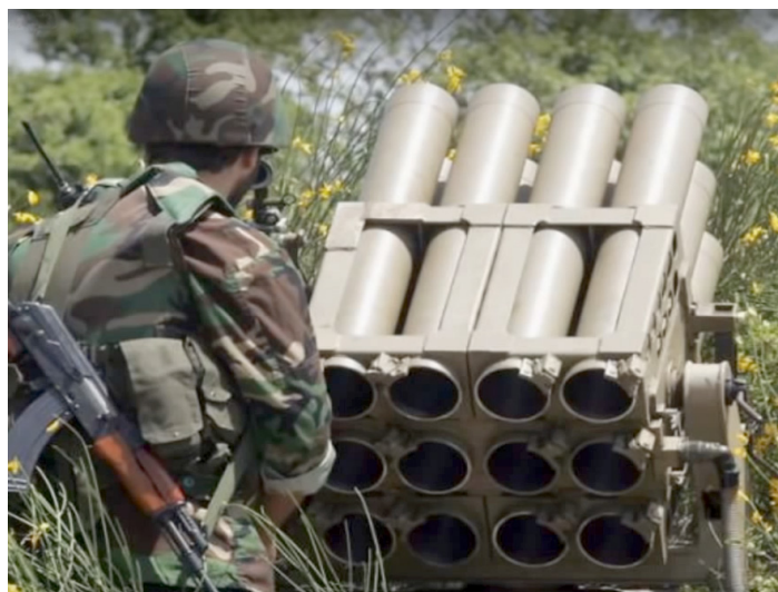
This image from a Hezbollah video shows a rocket launcher and one of its fighters in Syria.

Efforts in the United States to intensify financial pressure have continued every year since 2014 when the U.S. Congress passed the Hezbollah International Financing Prevention Act. The law punishes international financial institutions that knowingly en-