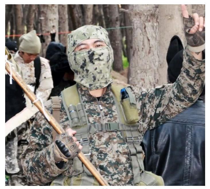
This image from a video released by al-Furat shows an Indonesian Islamic State recruit in Syria.

According to Jakarta police chief General Tito Karnavian, Bahrun Naim is involved in a power struggle for the leadership of Katibat Nusantara, the Malay Islamic Archipelago Unit of the Islamic State in Syria.