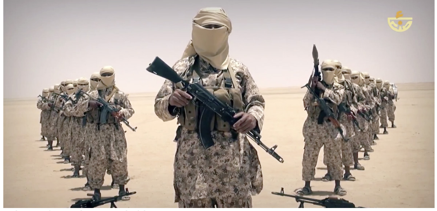
In this image from an Islamic State video fighters train in Yemen.

Throughout 2015, AQAP and the Islamic State in Yemen focused primarily on domestic enemies, particularly the Houthis. However,