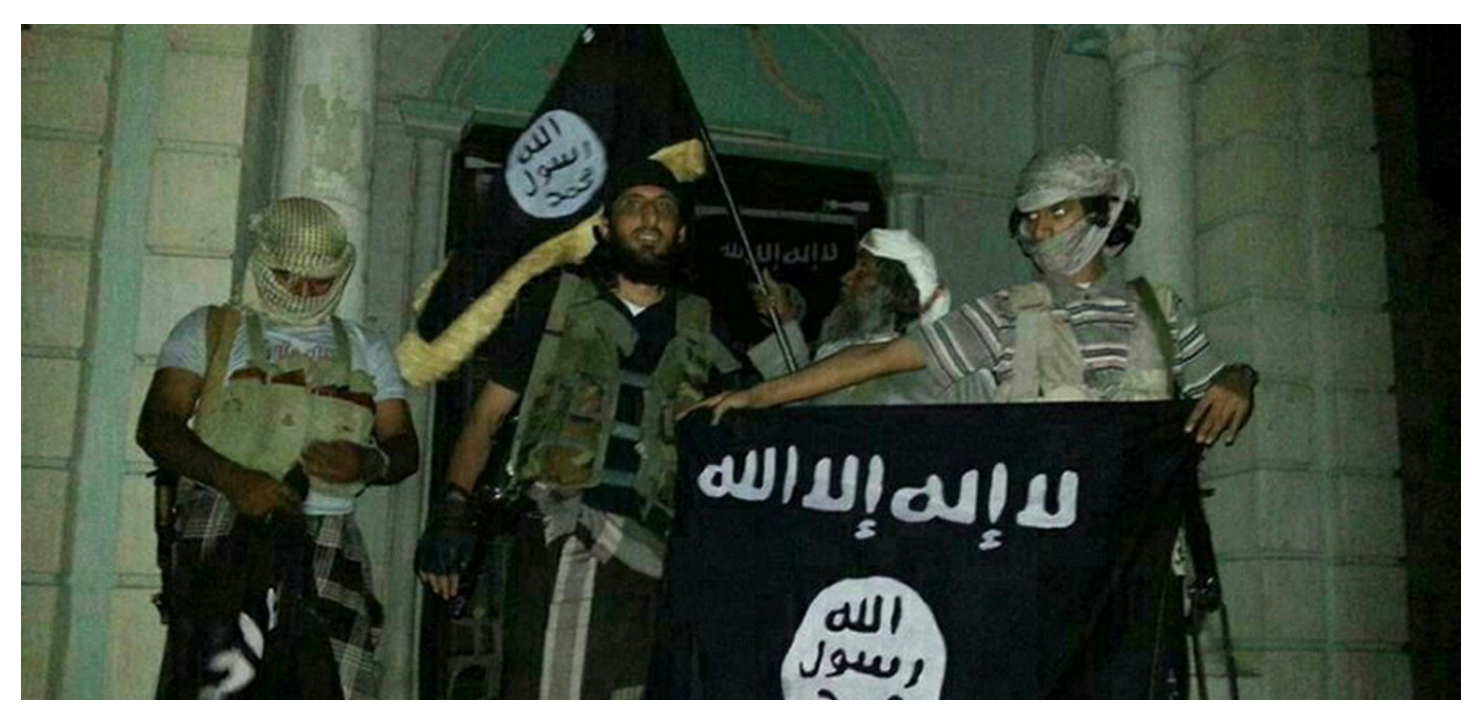
AQAP militants pose in front of a museum in Sayun, Hadramawt province, Yemen.