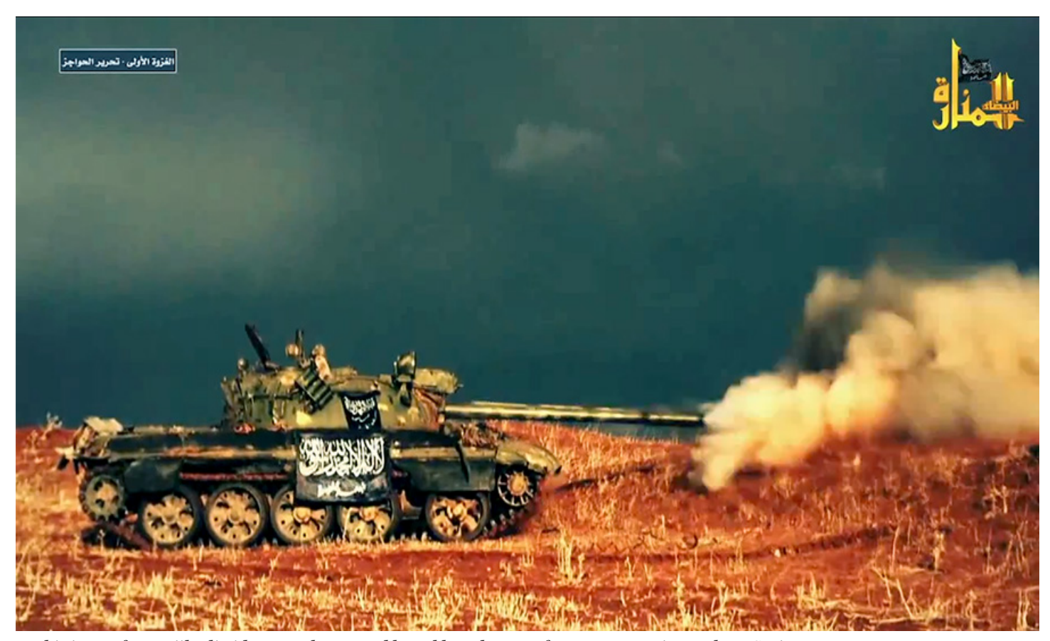
In this image from a jihadi video, a tank operated by Jabhat al-Nusra fires on a target in northern Syria.