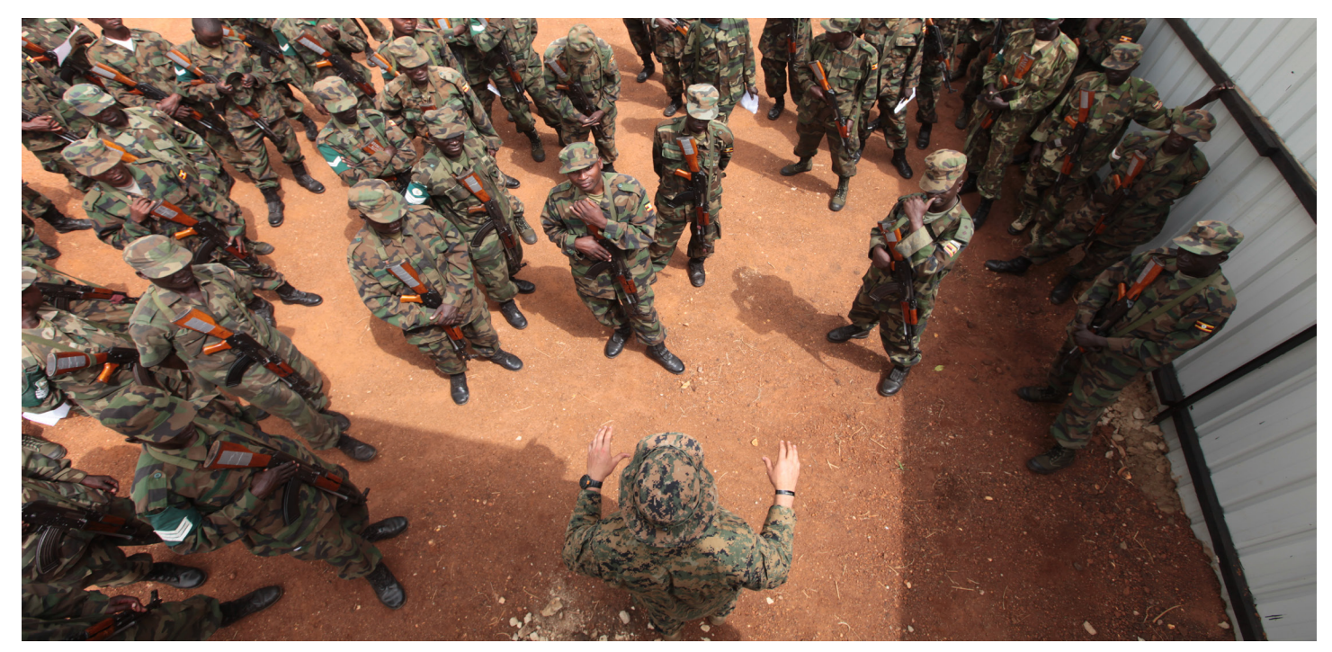
A U.S. Marine trains Ugandan soldiers for the fight against al-Shabab.