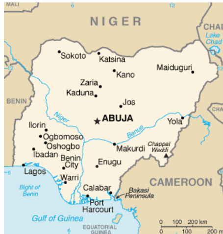
A map of Nigeria.

Following Boko Haram's August 9 threat on the south, the group did not carry out any successful attacks in southern Nigeria. In fact, all of the approximately 500 Boko Haram attacks recorded since 2009 were carried out in the country's northern zones. 5 During this period, Boko Haram expanded its operations from its original bases in Yobe and Borno states in the far northeast to North-Central zone's commercial capital of Kano and North-West zone's traditional capital of Sokoto, and to the Middle Belt states of Plateau, Kaduna and Kogi, but the threats to attack the south were never realized. 6