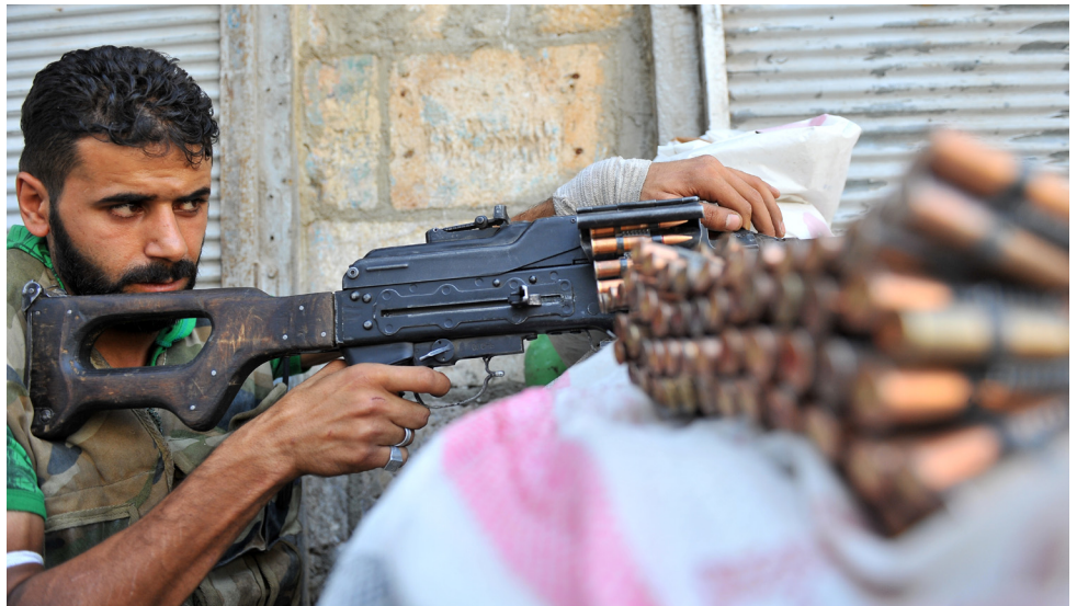
A Syrian rebel in the city of Aleppo on August 18, 2012.

ON AUGUST 6, 2012, President Bashar al-Assad's prime minister defected, dealing another blow to the Syrian leader's efforts to preserve his regime. Since the start of the Syrian uprising in March 2011, the strong central authority the al-Assad regime built and institutionalized during four decades has been rapidly crumbling. Yet the factors that made Libya's uprising succeed—a united and organized opposition, sparse population patterns and a weak army—are absent in Syria. The country becomes more militarized after each passing week, with various, competing rebel groups gaining more leverage and territory—and even reportedly committing their own massacres. 1 For now, the rebels—habitually termed the Free Syrian Army 2