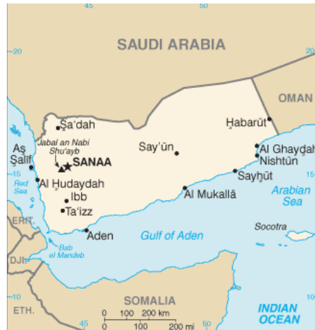
A map of Yemen.

leadership of Husayn's younger half-brother, Abdul Malik. 6 By the sixth war in 2009, an aura of invincibility surrounded Huthi fighters as they pushed the fighting beyond Yemen's borders. In November 2009, the Saudi Arabian military intervened to support the Yemeni government in its fight with the Huthis. 7 Three months later, the Huthis accepted a Qatari-negotiated cease-fire that teetered along during the following year. 8