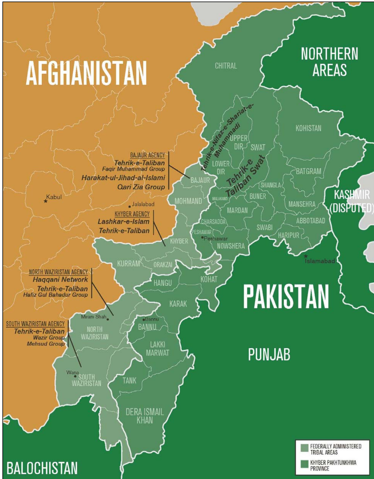
Map 2: General Breakdown of Insurgent Command Zones in the FATA and KPP