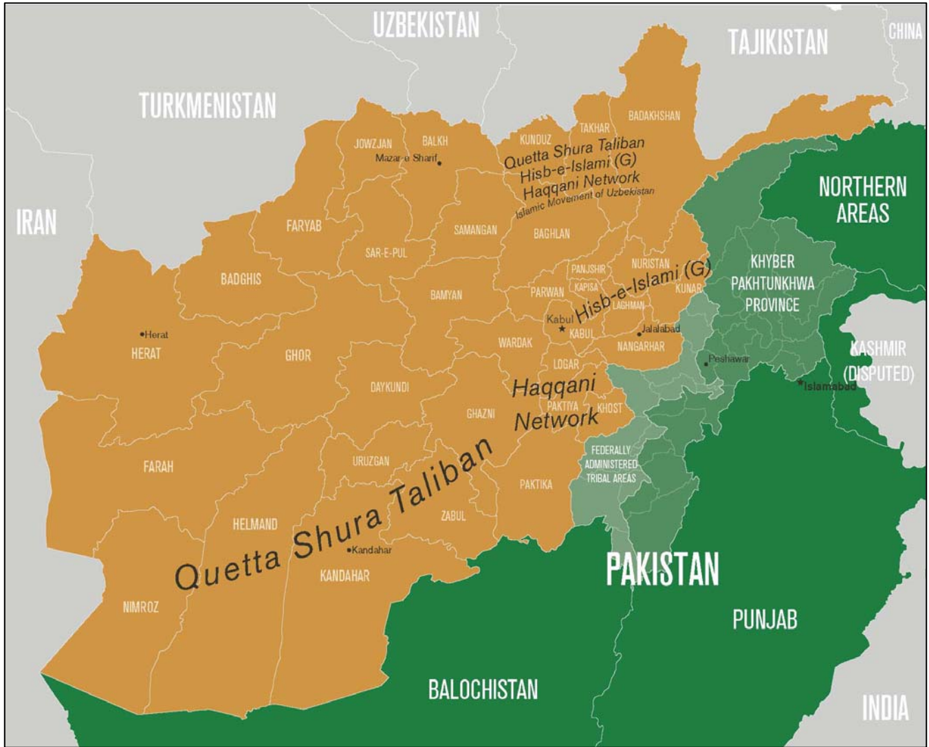
Map 1: General Breakdown of Taliban/Insurgent Areas of Activity in Afghanistan