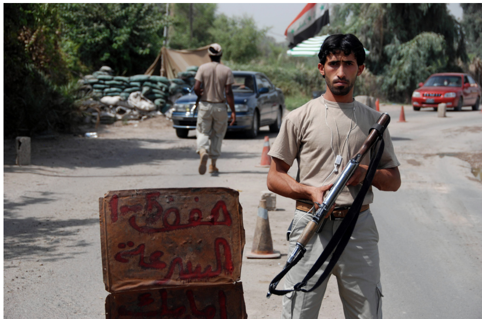
A Sons of Iraq fighter guards a checkpoint in Baghdad.

ONE OF THE MOST striking aspects of operations in Iraq during the "surge" of 2007 was the growing tribal uprising against al-Qa`ida. In late 2006 and 2007, this uprising began to transform the war. I spent considerable time on the ground throughout May and June 2007 in Baghdad and the surrounding districts working with U.S. and Iraqi units, tribal and community leaders and fighters engaged in the uprising. Listening to them talk, watching their operations and participating in planning and execution alongside American commanders supporting them provided insight into their motivations and thought processes. Moreover, during this process of participant observation I was able to gather some field data on the relationship between globally-oriented terrorists in Iraq (primarily al-Qa`ida) and the locally-focused militants who found themselves fighting as "accidental" guerrillas in the early