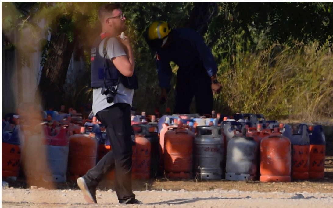
A policeman walks past gas bottles in Alcanar, Spain, on August 18, 2017, during a search linked to the Barcelona and Cambrils attacks.