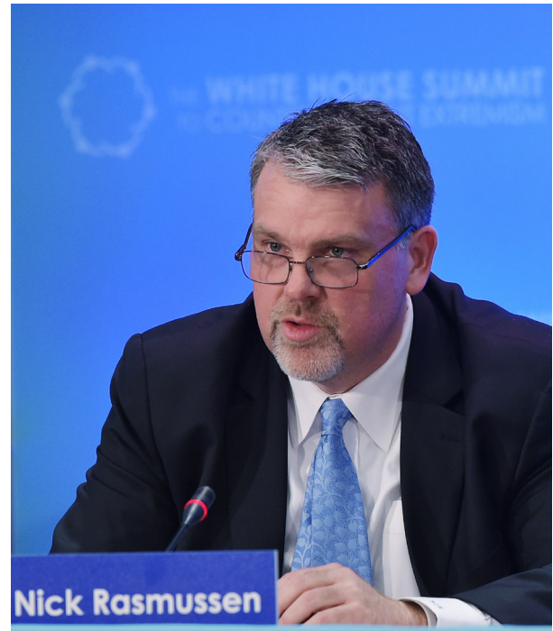
Then Director of the National Counterterrorism Center Nicholas Rasmussen speaks at the White House Summit to Counter Violent Extremism at the State Department on February 19, 2015, in Washington, D.C.

Rasmussen: Yes. In one respect, yes. I'm often asked the question "does this make it harder to gain [the] kind of, international cooperation of the sort we need to carry out our counterterrorism activities?" And there, I'm much more confident the work we are doing