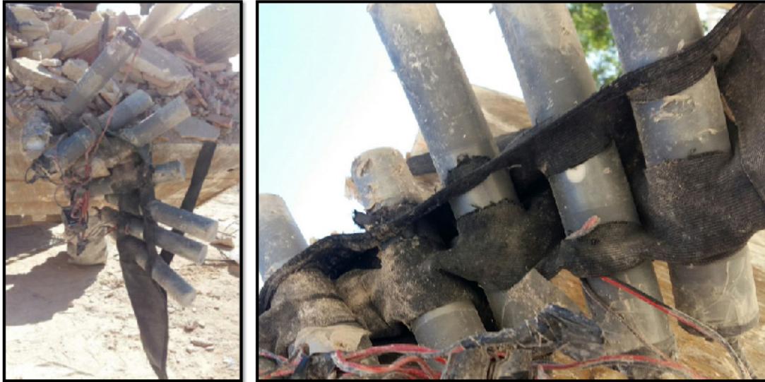
The viable suicide vest found in the rubble at the cell's Alcanar bomb factory. Photographs from different angles obtained by the authors from investigators.