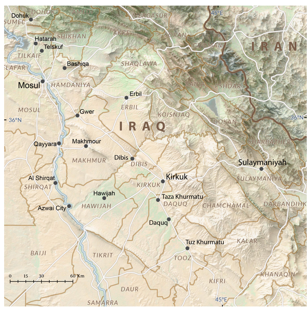
Map 1: Northeastern Iraq (Rowan Technology)

by Islamic State militants to train and organize attacks in nearby areas of northern Iraq. <sup>11 c</sup> Islamic State commanders and fighters have maintained training camps along the Hamrin range to learn and maintain the skills of their jihadi recruits. <sup>12</sup> Additionally, Islamic State fighters have reportedly built medical facilities in the mountains to treat their wounded. <sup>13</sup> Vulnerable oil infrastructure in the fields abutting the Hamrin range is often a target of the group's asymmetric attacks. <sup>14</sup> The Islamic State employs sabotage tactics meant to inflame issues in Iraq that have remained unresolved since 2003. For example, on May 24, 2018, militants damaged power lines in the village of Barimah located north of the Bajii-Kirkuk road, which resulted in cutting off power to the Sunni Arab majority cities of Hawija and Tikrit in the midst of a heat wave. <sup>15</sup> Public anger over power shortages <sup>d</sup> has been further stoked by Islamic State mil-