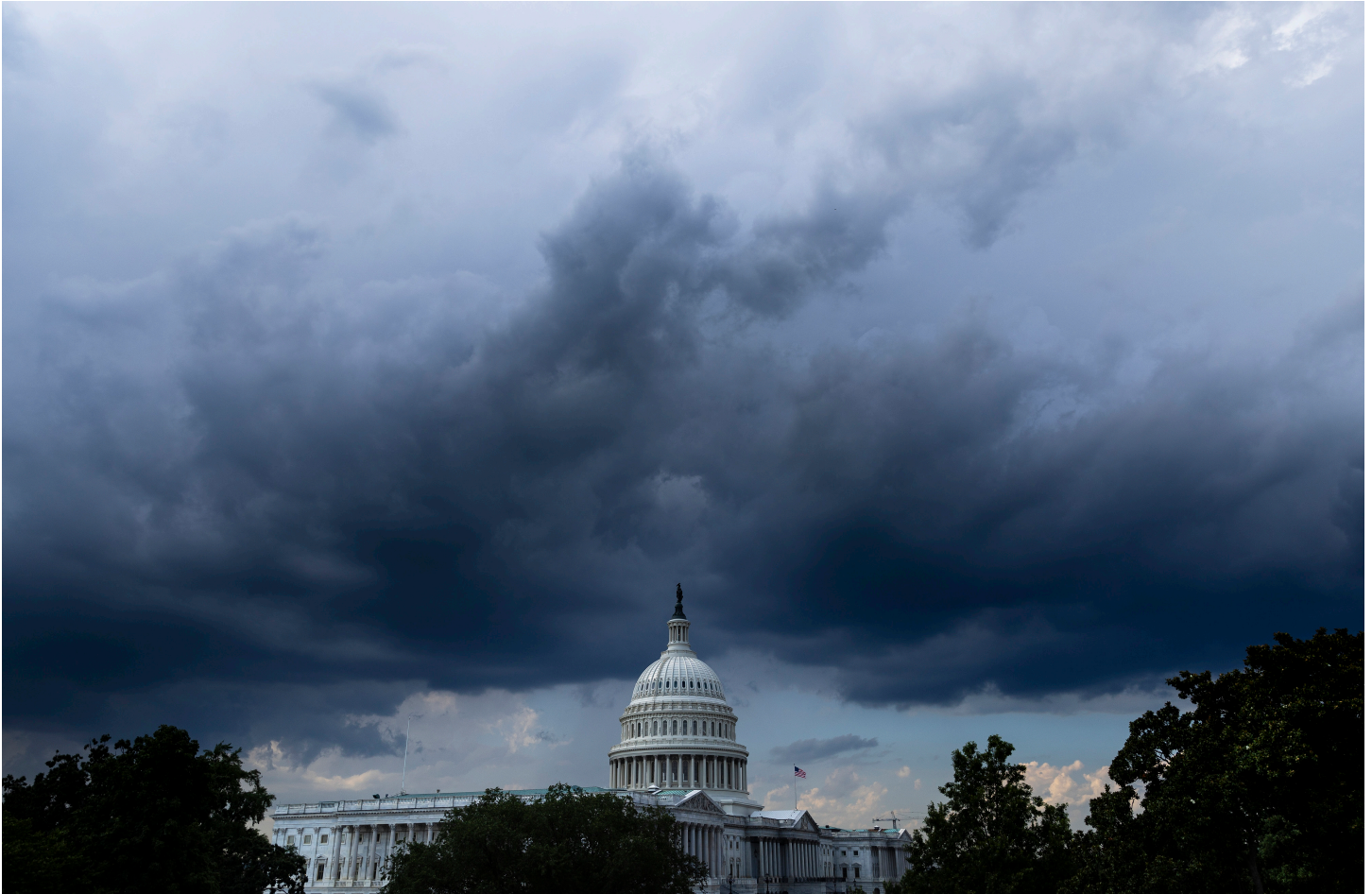
Storm clouds roll over Capitol Hill in Washington, D.C., on July 21, 2022.

attention, supportive national media outlets, not insignificant popular support, and even the presumed approval of some political leaders. Therefore, they have less ‘need’ for terrorist attacks, which could alienate public support, leave them more vulnerable to government pursuit and prosecution, and force them to go underground. Demographic differences between the left-wing radicals of the 1970s and today’s right-wing extremists may also discourage personal decisions to drop out and ‘go underground.’ The extreme right can build a national movement without the terrorism seen in previous waves.