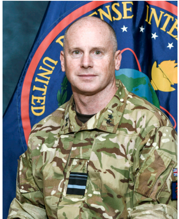
Air Vice-Admiral Sean Corbett

I think you can therefore use open sources to build a good picture about what's actually happening in a crisis situation and assess what you think is going happen there. The narrative and the reporting and the assessment that have come from some of the mainstream media in past conflicts have frankly been quite shocking. It is now a lot more mature and they are starting to ask people like myself