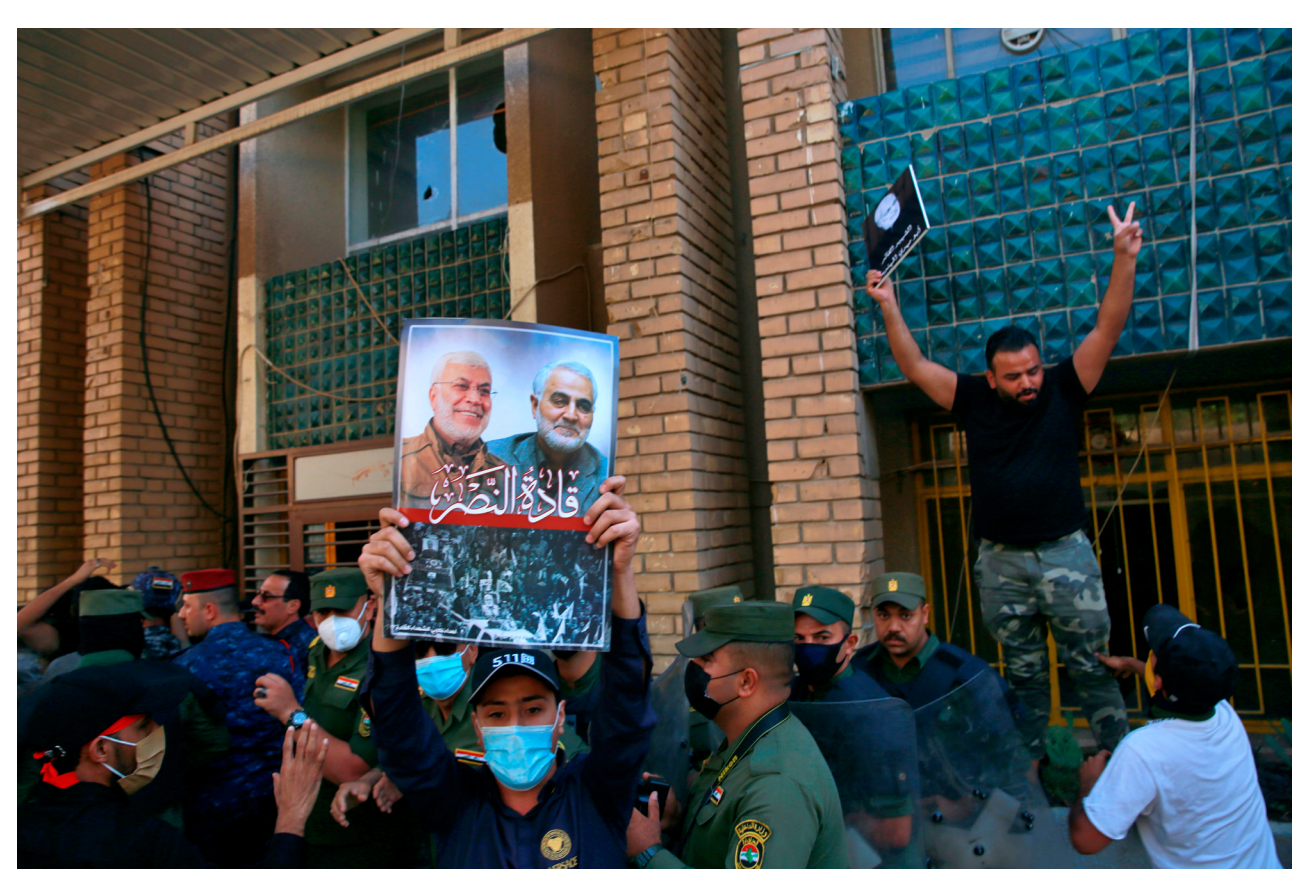
A supporter of an Iran-backed militia holds a poster of Iranian General Qassem Soleimani and deputy commander Abu Mahdi al-Muhandis during a protest by pro-Iranian militiamen and their supporters in Baghdad, Iraq, on October 17, 2020.

unaware of the nature of the movement<sup>r</sup> at the time in the chaos of the 2014 mobilization, when recruits were randomly assigned to PMF units at mobilization hubs like Taji and Samarra.<sup>46</sup>