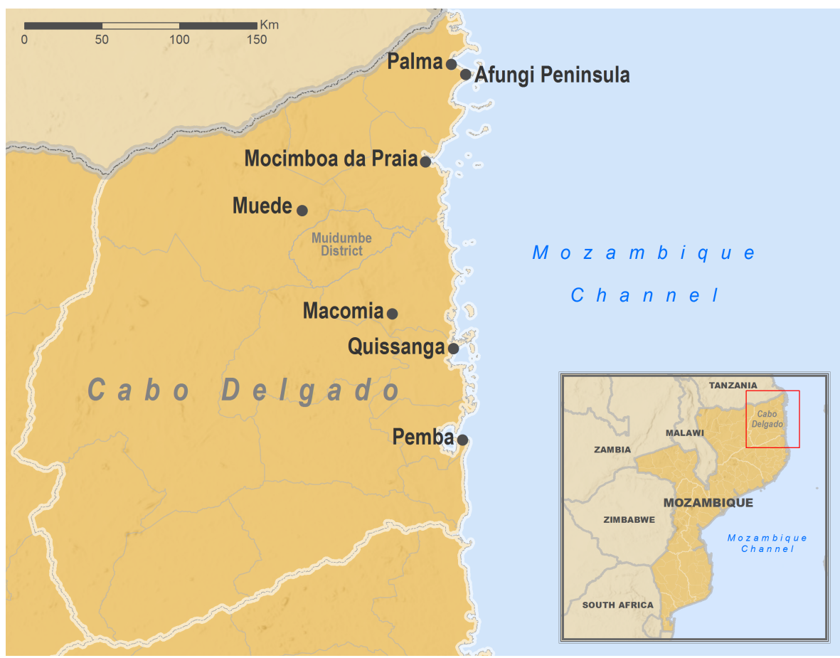
Cabo Delgado, Mozambique

Construction Services, in June 2020. To In August 2020, Total signed a security agreement with the Mozambique government through which the company will provide logistical support to a newly established joint taskforce that will protect its Afungi facilities and surrounding areas. This suggests the company is concerned about the reach of the insurgency. But the agreement also runs the risk of diverting better elements of the Mozambican army away from the rest of Cabo Delgado.