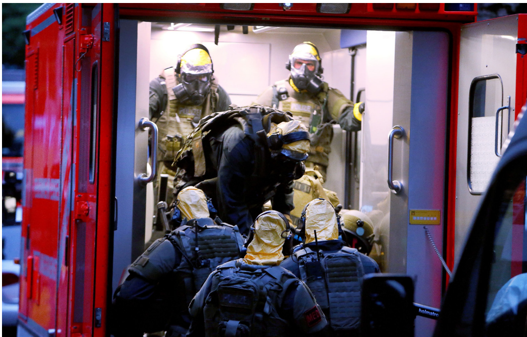
Police officers of a special unit wear protective clothes and respiratory masks during an operation on June 12, 2018, in Cologne's Chorweiler district, western Germany, where police found toxic substances after storming an apartment.

Furthermore, investigators found out that Sief Allah H. had