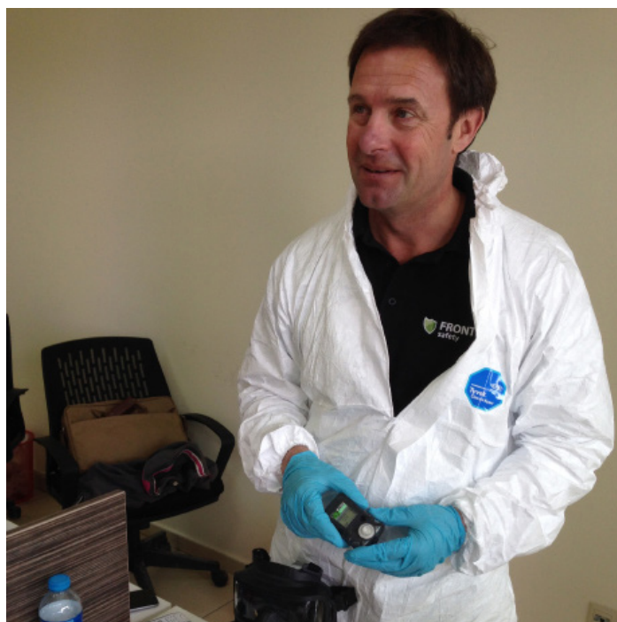
Hamish de Bretton-Gordon in the Turkey-Syria border area analyzing samples after a suspected chlorine attack in Syria

What makes chemical weapons attractive to groups like ISIS is the terrible psychological impact of chemical weapons. I've witnessed how these chemicals have frightened even experienced doctors in Syria and Iraq, deterring them from responding to such