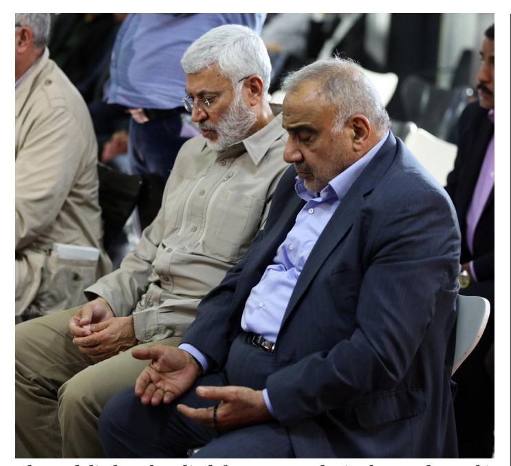
Abu Mahdi al-Muhandis, left, a commander in the Popular Mobilization Forces, and Adil Abd Al-Mahdi, right, then Minister of Oil and now Prime Minister of Iraq, attend the funeral of Iraqi politician Ahmad Chalabi, in Baghdad, Iraq, on November 3, 2015.

PMF Basra Operations Command, both led by Badr commanders.<sup>98</sup> These commands appear to be maintained by Badr in readiness for any of a number of contingencies: the deployment of Badr PMF units to restore order during electricity-related or secessionist rioting, to deliver civil engineering and disaster relief, or to crack down on uncontrolled militias.<sup>t</sup>