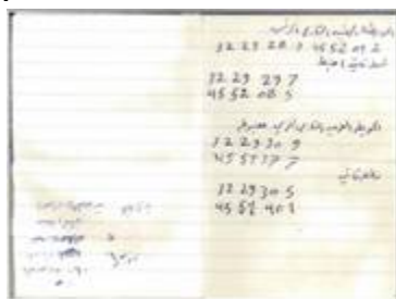
Document captured during the objective

The document shows the points used to calculate salary. [Detainee] has no knowledge of who developed the point system. [Detainee] heard [REDACTED] speak about raising salaries by using a point system. The system was implemented about two to three months prior to [Detainee]’s day of capture. [Detainee]’s salary was raised from 300,000 IZD to 400,000 IZD. [Detainee] received two payments at the 400,000 IZD salary level prior to being detained.