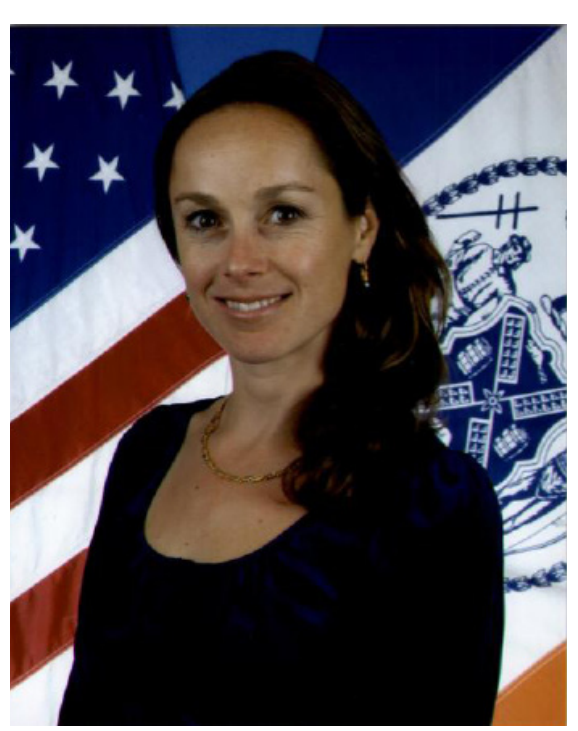
NYPD Assistant Commissioner for Intelligence Analysis Rebecca Weiner

CTC: Notwithstanding the attacks in late 2018 in Strasbourg and Manchester, there seems to have been from late 2017 some reduction in the threat from jihadi terrorism in Europe because of the demise of the Islamic State caliphate, the removal from the battlefield of many of the group's external operations plan-