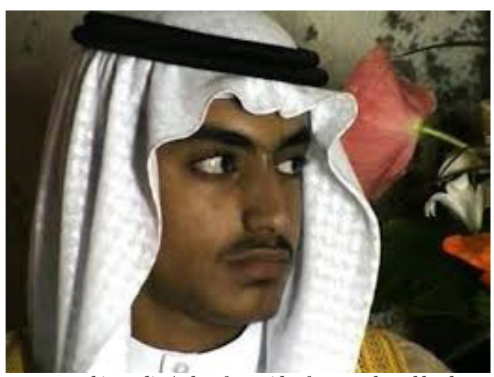
Hamza bin Ladin (taken from video footage released by the Central Intelligence Agency following the 2011 raid on Usama bin Ladin's compound)

calling them "failed experiments" that were representative of the "swamp of the corrupt." Al-Zawahiri further emphasized that in the "call of jihad," there is nothing higher than defending sharia law, and emphasized that sharia—what he referred to as al-Qa`ida's "doctrine of governance"—should never be abandoned. Al-Zawahiri also issued repeated critiques of governments in Muslim-majority countries that al-Qa`ida believed were corrupted by secular law, particularly Egypt, which was mentioned in seven of the 13 statements, and other North African nations such as Tunisia, Libya, Morocco, and Algeria. In January 2018, al-Zawahiri claimed that the "tyrannical regimes" in North Africa had been corrupted and that sharia-based governance was "sacrificed" in these areas in order to please the West.