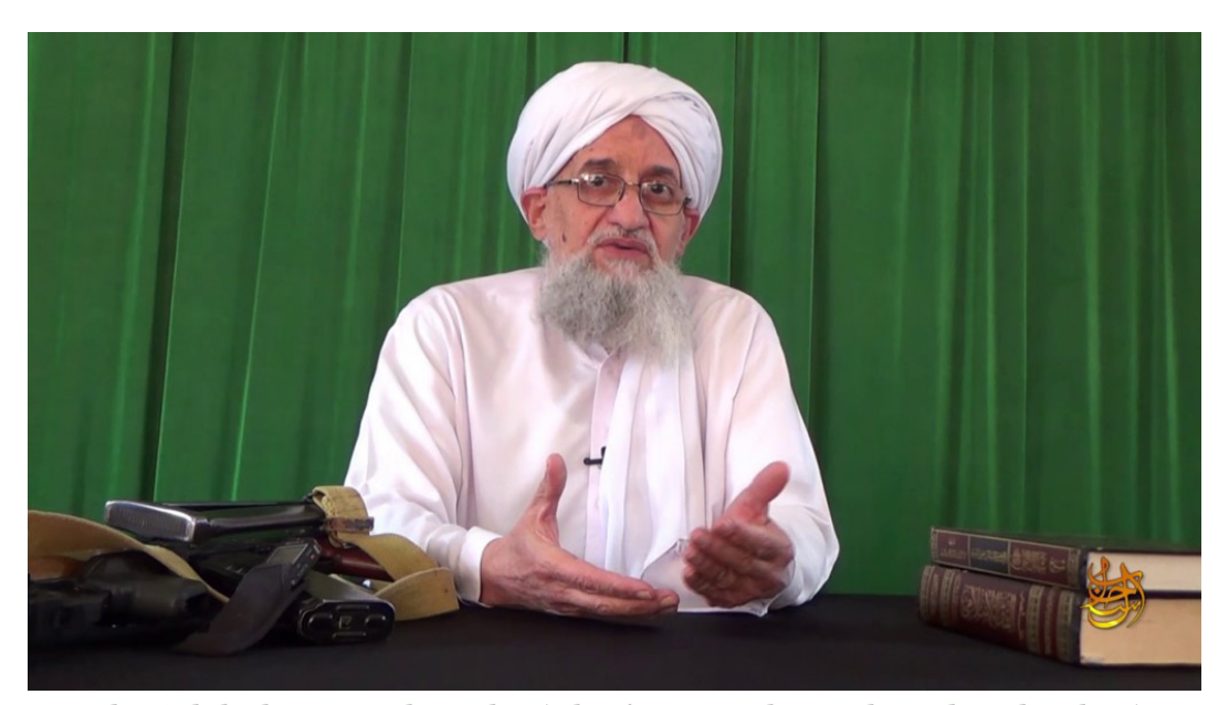
Al-Qa`ida leader Ayman al-Zawahiri (taken from a March 2018 al-Qa`ida media release)

b Turkistan is a reference to a historic region that encompasses wide swaths of Central Asia and stretches from Siberia to Iran and Afghanistan.