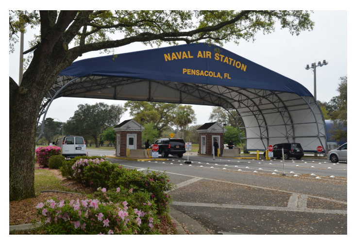
The main gate at Naval Air Station Pensacola on Navy Boulevard in Pensacola, Florida, is pictured on March 16, 2016.

theological grounds, even for a terrorist group.