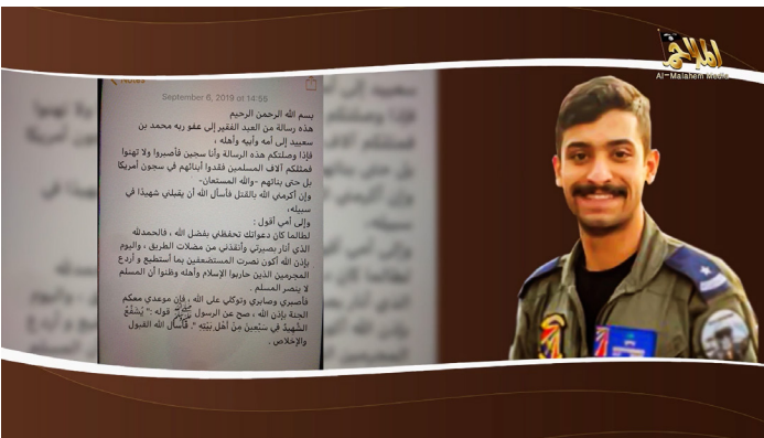
Figure 1: Still images from the video "And Heal the Breasts of a Believing People: Blessing and Declaration of Responsibility for the Attack on the US Naval Air Station Pensacola Florida" released by AQAP's al-Malahem Media Foundation on February 2, 2020. The pictures (which the author has not authenticated) purport to show Mohammed Alshamrani in military uniform as well as part of his last will and testament (apparently written on the iPhone Notes App). The screen captures also include images of now deceased AQAP leader Qassim al-Rimi.