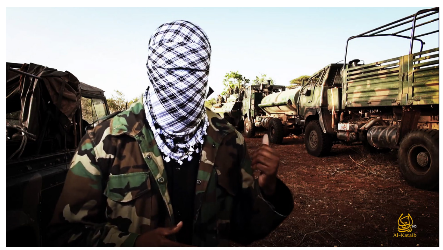
Al-Shabaab's U.K. English-language narrator and media operative, who has never been identified by the group, stands against a backdrop showing Kenya Defence Forces vehicles the group claimed to have seized during its attack and temporary capture of the KDF's El-Adde military base in Somalia's Gedo region on January 15, 2016. (Al-Kataib Media Foundation film, The Sheikh Abu Yahya al-Libi Raid: Storming the Crusader Kenyan Army Base at El-Adde – Islamic province of Gedo, released on April 9, 2016).

the ensuing battle was increased by press reports suggesting many more casualties than officially acknowledged, leading to domestic unease among families of missing or killed soldiers in Burundi.<sup>41</sup> This allowed al-Shabaab to step in and muddy the waters further with its own PSYOPS media push that began with a public event a day after the battle during which the bodies of some of the Burundian casualties were put on display.<sup>42</sup> This event, along with battle footage, was later featured in a documentary-style film released on November 12, 2011, by al-Shabaab, The Burundian Bloodbath: Battle of Dayniile .