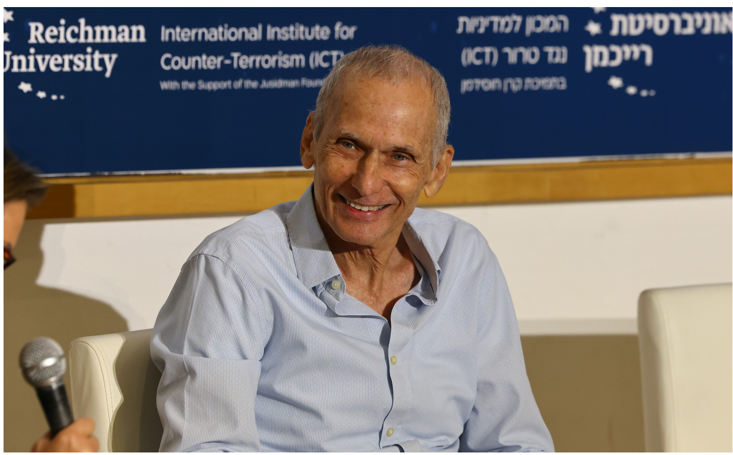
Omer Bar Lev

2022, we built and budgeted a plan to first equip the above eight companies and add over three years another 26 companies. The third "leg" is the Border Patrol volunteers, which are active mostly in the rural parts of the country and currently stand at about 7,000-strong. These volunteers will have their full gear at home so that within six hours they can be with their company where they are needed. We were able to accomplish that as well.