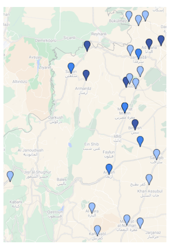
Figure 1: Pre-January 2014 ISIL presence in its Wilayat Idlib

Even before ISIL made its caliphate announcement, rallies calling for the caliphate to be restored were staged in cities under JN control, like Binnish, where the Islamic State would gain full control. There are also numerous reports that Abu Bakr al-Baghdadi himself went from Iraq into Syria (Aleppo and Idlib) in February-March 2013 to drum up support among foreign fighters in the lead-up to the ISIL announcement. This gave ISIL a foothold in some of these areas, as well as elsewhere in northern Syria. It also facilitated the group's efforts to gather intelligence on its opponents, whom it would later attack and kill. A local source