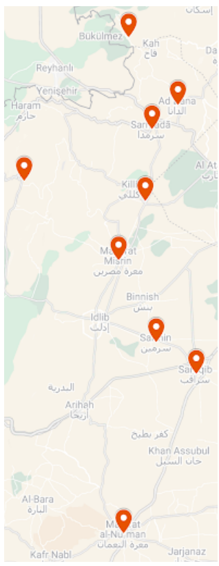
Figure 3: Areas in Idlib the Islamic State had prior territorial control in 2013 and where it also claimed attacks since 2015 in the greater Idlib region

There were 25 locales where the Islamic State had varying levels of control in the greater Idlib region in 2013 and 24 places where the Islamic State has claimed attacks in the greater Idlib region since 2015. Nine of those spots overlapped: al-Dana, Atme, Hazano, Kfar