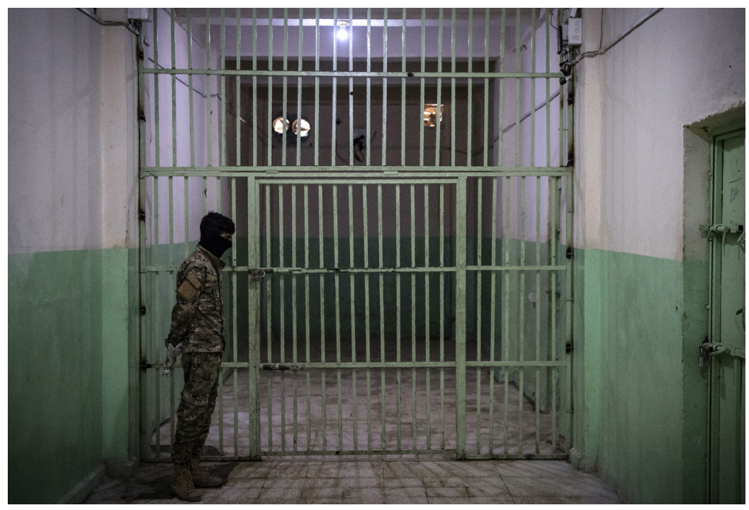
A member of the Syrian Democratic Forces stands guard in a prison where men suspected of being affiliated with the Islamic State are jailed in Hasakeh, Syria, on October 26, 2019.

the past few years, with the hopes of situating these incidents within the recent history of prison attacks. The authors' findings are two-fold. First, drawing on previous literature, historical attacks, and the current reemergence of jihadi groups' attempts to target prison systems, the authors find that three considerations drive jihadi prison assaults and riots. In planning these types of attacks, jihadis are interested in restoring their force size, releasing incarcerated jihadi leaders or specialists, and/or creating a propaganda win.