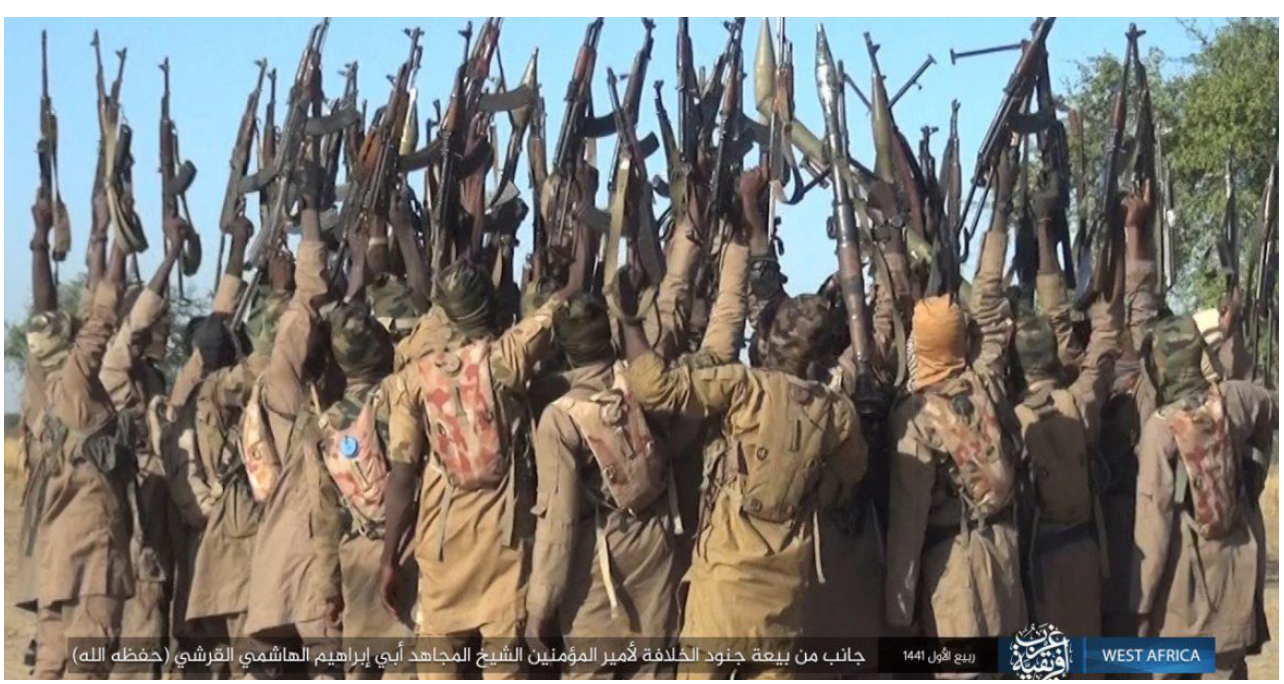
Islamic State media release showing Islamic State West Africa Province (ISWAP) fighters pledging allegiance to new Islamic State leader Abu Ibrahim al-Hashimi al-Qurashi following the death of Abu Bakr al-Baghdadi, published November 7, 2019.

project. By November 15, 2019, almost every African Islamic State province and non-province affiliate except for Algeria<sup>b</sup> had quickly pledged allegiance<sup>c</sup> to the Islamic State's new leader, Abu Ibrahim al-Hashimi al-Qurashi, who the U.S. government has identified as Amir Muhammad Sa'id 'Abd-al-Rahman al-Mawla.<sup>1</sup>