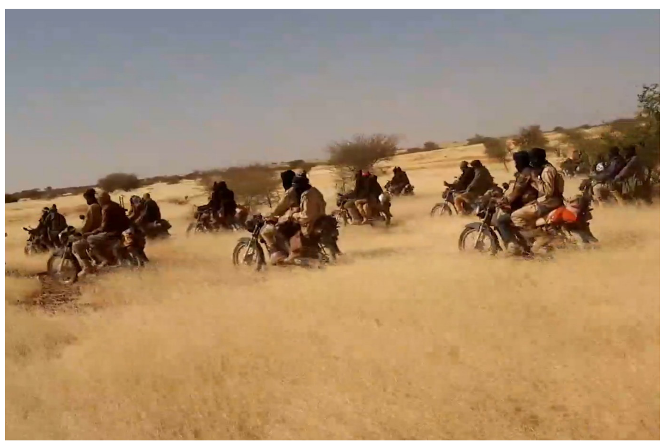
Screen capture showing the launch of an attack against a Nigerien army base on December 10, 2019, in the town of In-Ates, featured in the first official, full-length, high-quality video by the Islamic State dedicated to ISGS, entitled "Then It Will Be for Them A [Source Of] Regret," released on January 10, 2020.

From being a small group—greatly underestimated and relatively shrouded in secrecy compared to its al-Qa`ida-aligned counterparts in the Sahel—there was a discernible change in ISGS's capabilities in 2017. In that year, the group grew as it managed to mobilize a large number of fighters against the backdrop of intercommunal violence in the Mali-Niger borderlands,75 and also received militants defecting from its Sahelian al-Qa'ida-affiliated counterpart, Jama'at Nusrat al-Islam wal-Muslimin (JNIM), a Sahelian jihadi conglomerate that served as a uniting umbrella group for five other factions.<sup>76 m</sup> Operationally, ISGS went from undertaking small hitand-run attacks to much larger-scale,77 coordinated attacks against military outposts across Niger's northern Tillaberi region, including a particularly deadly ambush in Tirzawane in February 2017 that killed 16 soldiers,78 spurring Nigerien authorities to request the deployment of French troops.<sup>79</sup> An ISGS ambush in the village of Tongo Tongo, Niger, in October 2017 targeting a joint U.S.-Nigerien force-which killed four U.S. Green Berets and five Nigerien counterparts-served to definitively thrust ISGS from relative regional obscurity to the headlines.80