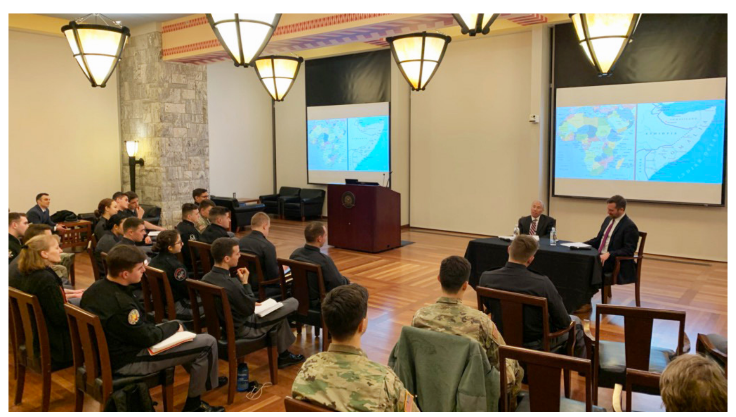
United States Ambassador to Somalia Donald Yamamoto is pictured during his February 2020 interview with Dr. Jason Warner at the United States Military Academy at West Point.

it is, in fact, moving away from a focus on looking at particular terror groups as the primary threat to U.S. national security to a new focus, to some extent, on near-peer competitors or great power competition. In other words, we're moving away from an era in which al-Qa`idaand transnational jihadi groups were looked at as the primary source of U.S. worry abroad, and increasingly, nation-state adversaries like Russia, China, and Iran are assuming that role. To the extent that that is the new outlook, how does the African continent figure into that? How do we think about the role of great-power competition or near-peer competition on the continent from your perspective?