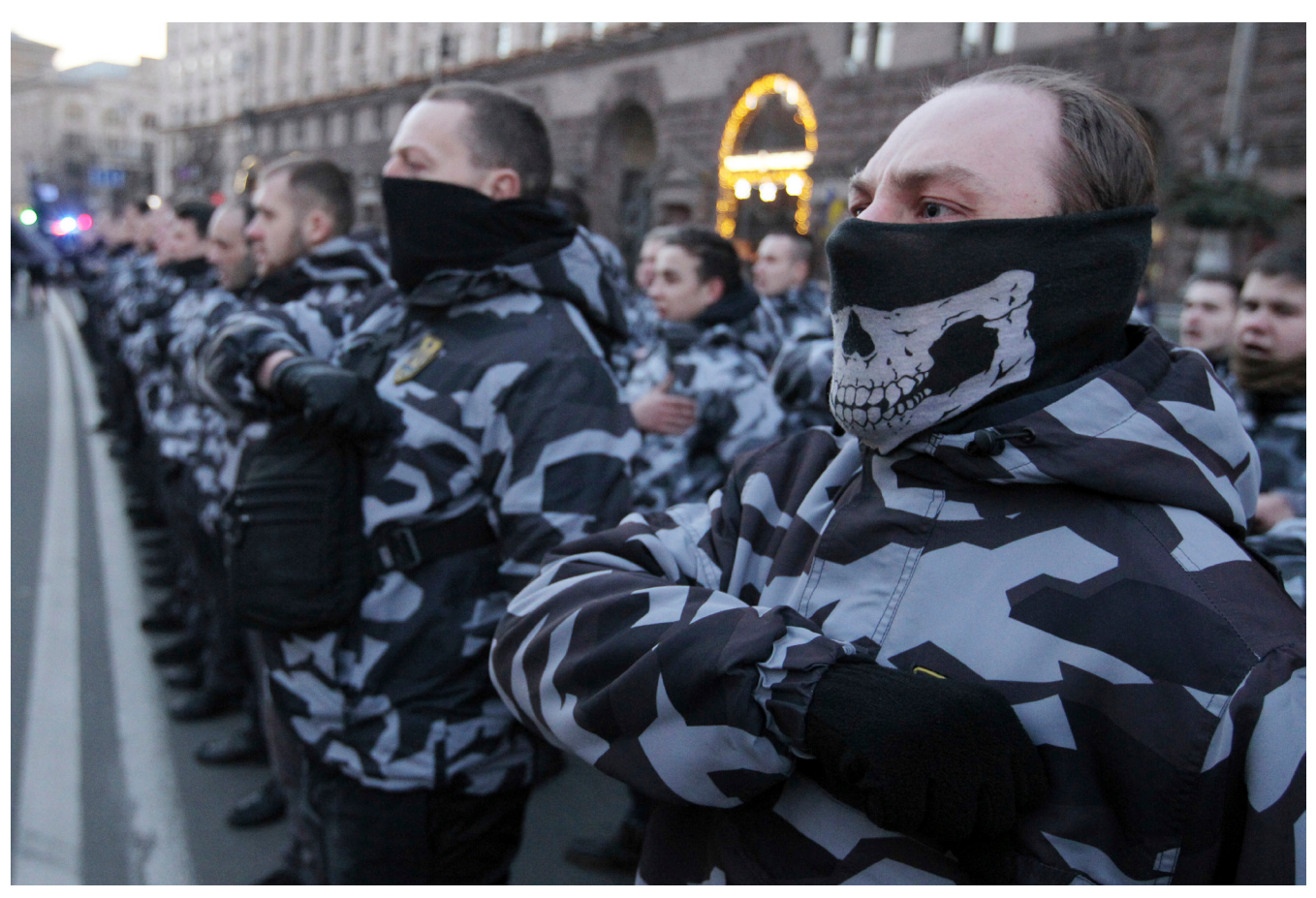
Activists of the Ukrainian far-right party National Corps are seen attending their march called "March of National Squads" at the Independence Square in Kyiv, Ukraine, on March 2, 2019.