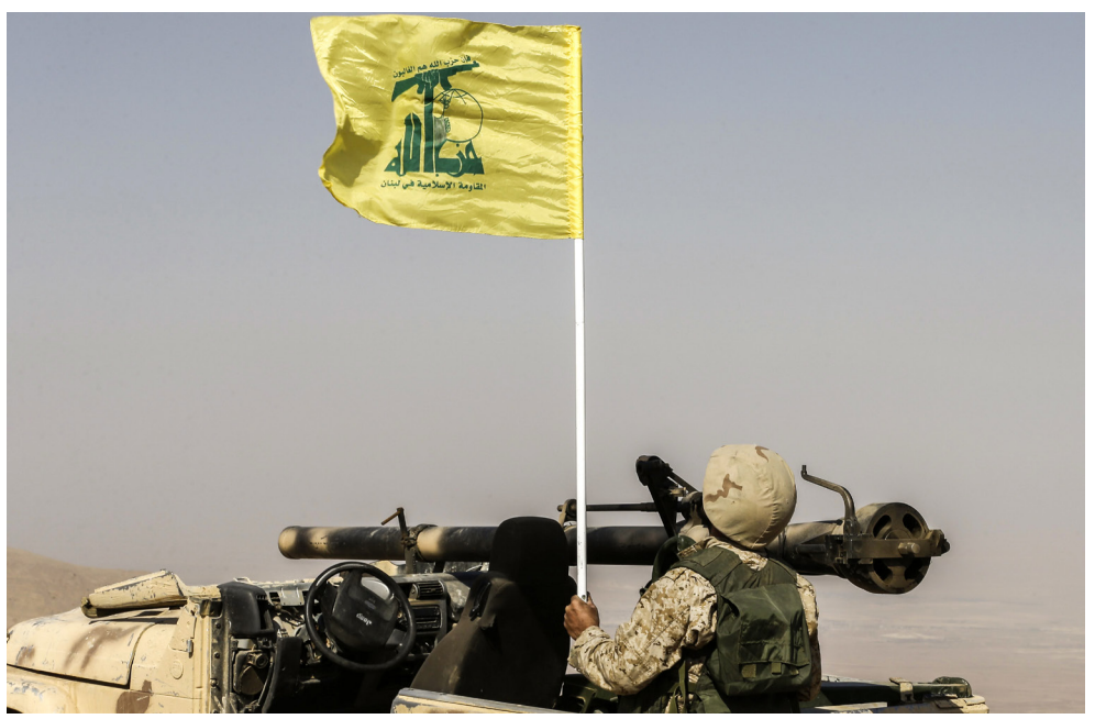
A photo taken on August 2, 2017, during a tour guided by the Lebanese Hezbollah group shows a fighter flying the group's flag in the vicinity of the Syrian town of Flita near the border with Lebanon.

its expeditionary units headed to Syria, consisted of Iraqi Shi`a and deployed throughout Syria in varying capacities.<sup>16</sup> Groups like Badr also helped to train Syrian Shi`a militias, transforming them into mobile rapid response units, modeled on smaller versions of Lebanese Hezbollah.<sup>17</sup>