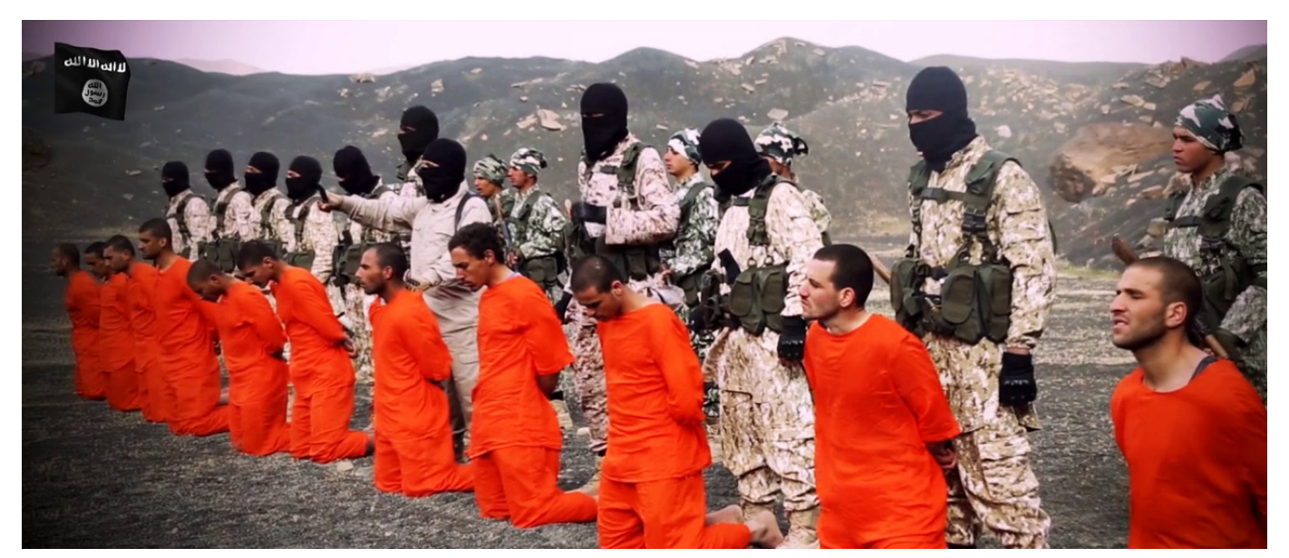
Image captured from a video produced by "Wilayat Damascus" on June 25, 2015, and entitled "Repent before We Overcome You," which shows the Islamic State executing Jaysh al-Islam fighters.

or organization." Yet, the future leaders of the Islamic State, the successors of AQI, practiced exactly what he cautioned against.<sup>a</sup> What explains this failure to learn from history, and what are the implications for countering similar movements in the future—other than to stand out of the way as they shoot themselves in the foot again?