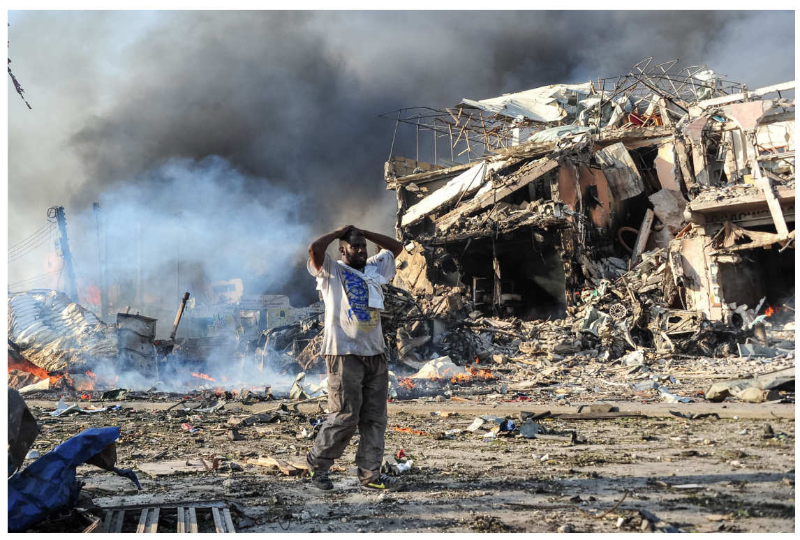
A Somali man reacts at the site of a double-truck bombing at the center of Mogadishu, Somalia, on October 14, 2017, which killed at least 350 people.

ally moved against challengers and eliminated critics,14 including high-profile foreign fighters. By the end of 2013, through a combination of military action and internal housecleaning, key al-Qa-`ida-linked international figures in al-Shabaab-Fazul Abdullah Mohammed, Bilal al-Berjawi, Omar Hammami-were dead, leaving the remaining foreign fighters cowed.<sup>15</sup> In subsequent years, more attractive theaters for foreign fighters (like Syria) arose, al-Qa`ida may have adopted a less-centralized organizational model,16 and Somalia's conflict entered a phase of increasingly internal and clan-based dynamics.17 While it continued to integrate foreign fighters, none from the sizeable Kenyan contingent, for example, achieved a top leadership role.18 Today, al-Shabaab occasionally directs some recruits from Ethiopia, Kenya, Tanzania, and Uganda to return to their homes to fight,<sup>19</sup> and the group continues to execute foreign fighters on accusations of spying.<sup>20</sup> The destructive capacity of al-Shabaab's IED attacks significantly increased in the same period that there was a purge of foreign fighter influences in the group, suggesting there is more behind this trend than the "continued arrival of foreign trainers" and "transfer of knowledge from other conflict areas."