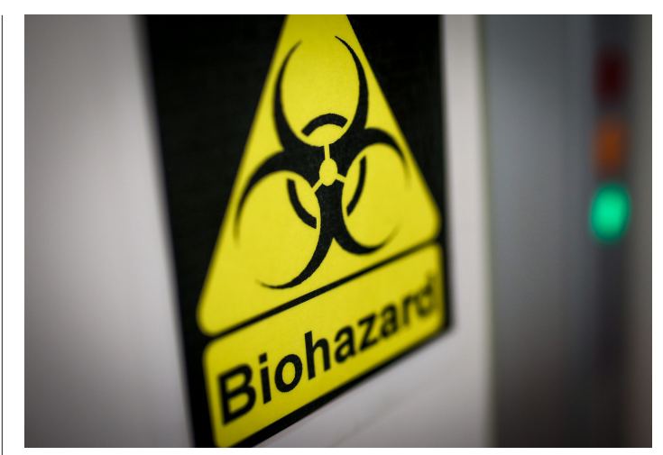
A biohazard sign is pictured on a restricted area door at a virology institute on March 3, 2020.

To address this gap, NTI is working with the World Economic Forum and international partners to develop and launch the International Biosecurity and Biosafety Initiative for Science (IBBIS), an independent organization that will have the mission of working collaboratively with global partners "to strengthen biosecurity norms and develop innovative tools to uphold them. IBBIS will undertake this work to safeguard science and reduce the risk of catastrophic events that could result from deliberate abuse or accidental misuse of bioscience and biotechnology."<sup>13</sup>